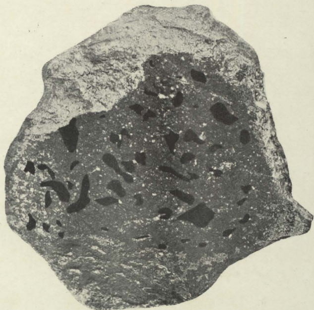
FIG. 1.—Greywacke with argillite inclusions, Makara Valley; polished slab.