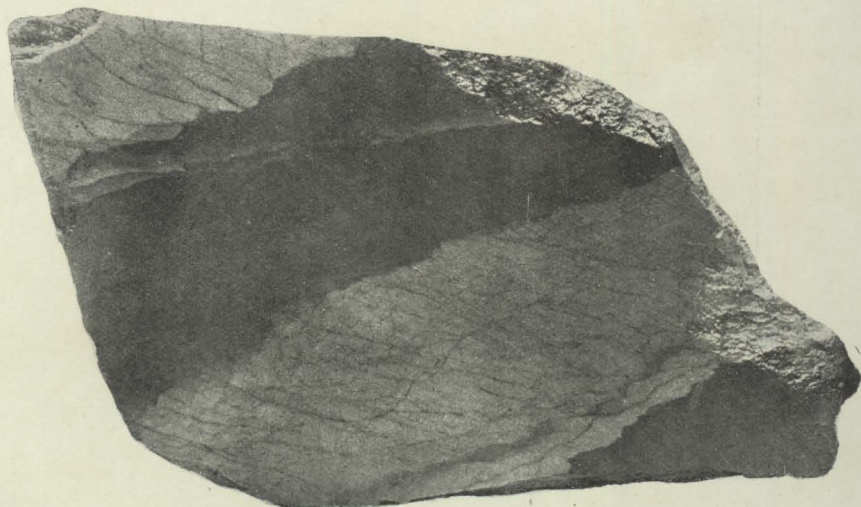
FIG. 2.—Green argillite, partly reddened; polished slab.