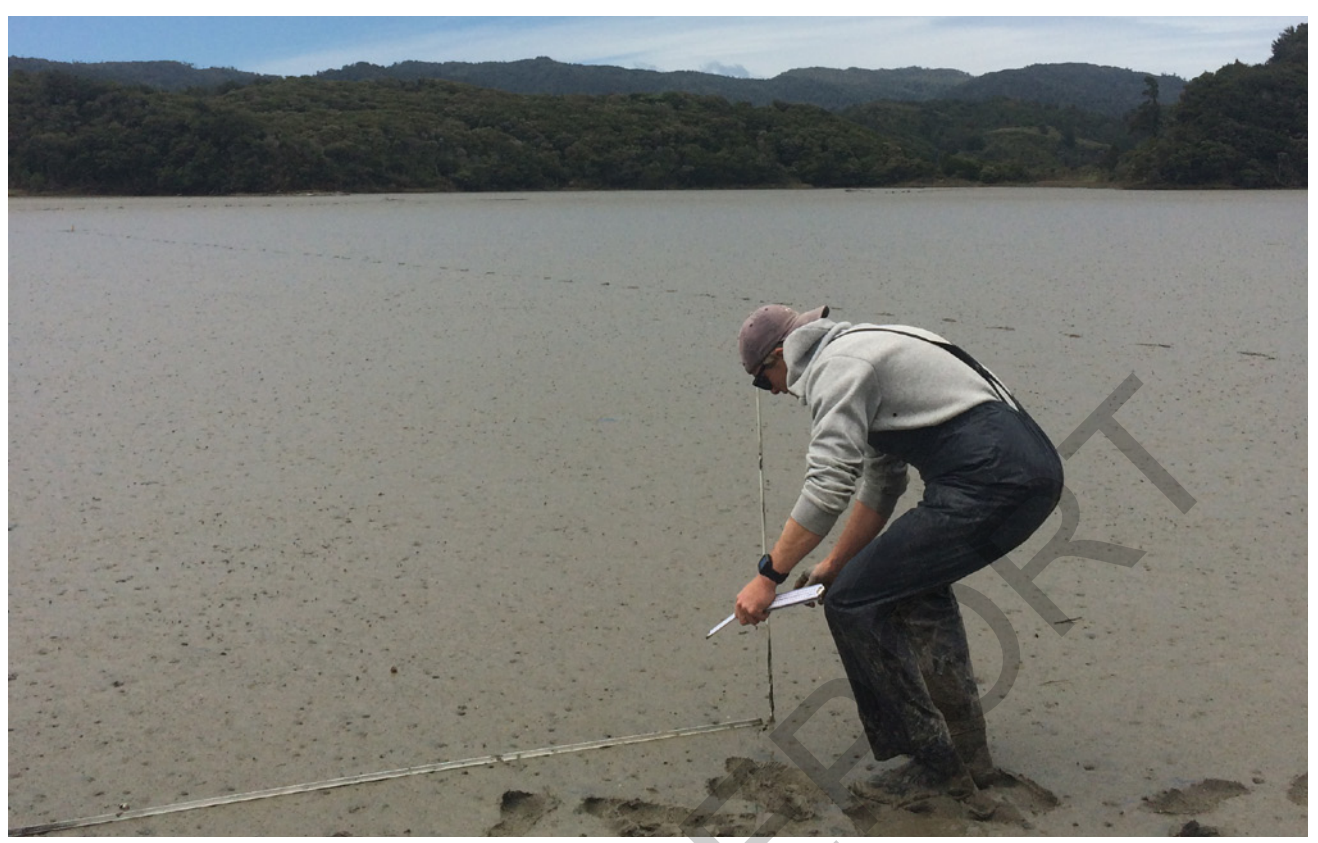
Whanganui Inlet, bare soft muddy sediments within the large main southern basin at Site C, January 2017.