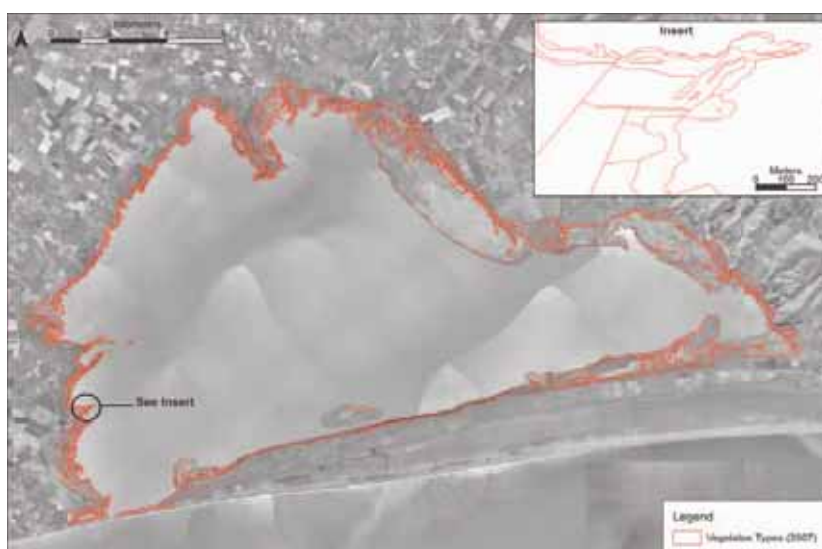
FIGURE 1. Vegetation mapping units for Te Waihora/Lake Ellesmere 2007.