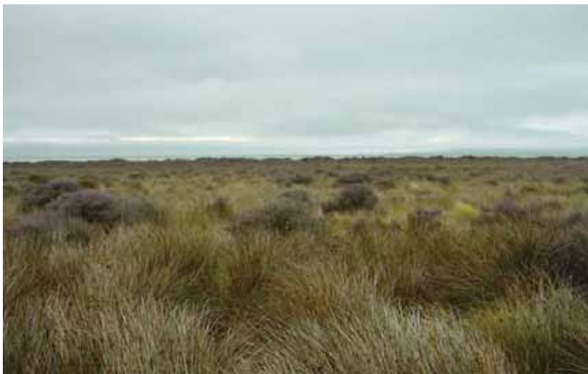
FIGURE 3. Native brackish wetland vegetation: sea rush ( Juncus kraussii ) and marsh ribbonwood at Kaitorete Spit.