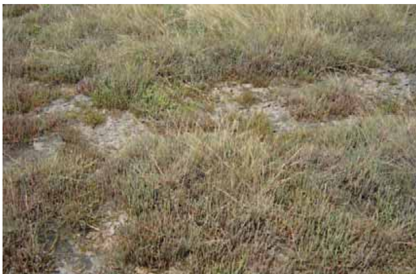
FIGURE 10. Hyper-saline native herbfield vegetation. Halophytic glasswort and saltgrass at Greenpark.