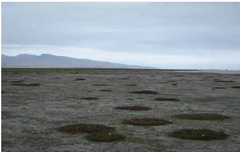
FIGURE 4. Native brackish wetland at Greenpark Sands: Sea primrose ( Samolus repens ) hummocks amongst purple mimulus and arrow grass ( Triglochin striata ) on sparsely vegetated flats.

lakeshore vegetation types, mapping, and therefore total area calculations, were only approximate due to lake water levels at both survey times.