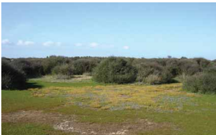
FIGURE 2. Native brackish wetland vegetation: marsh ribbonwood shrubland ( Plagianthus divaricatus ) bachelor's button ( Cotula coronopifolia ) – purple mimulus ( Mimulus repens ) herbfield – Yarrs Flat.