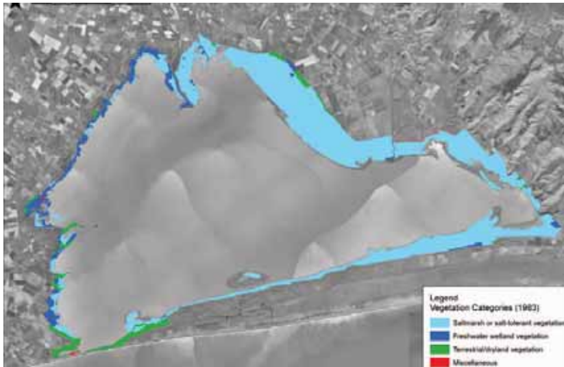
FIGURE 7. Patterns of lakeshore vegetation – 1983.