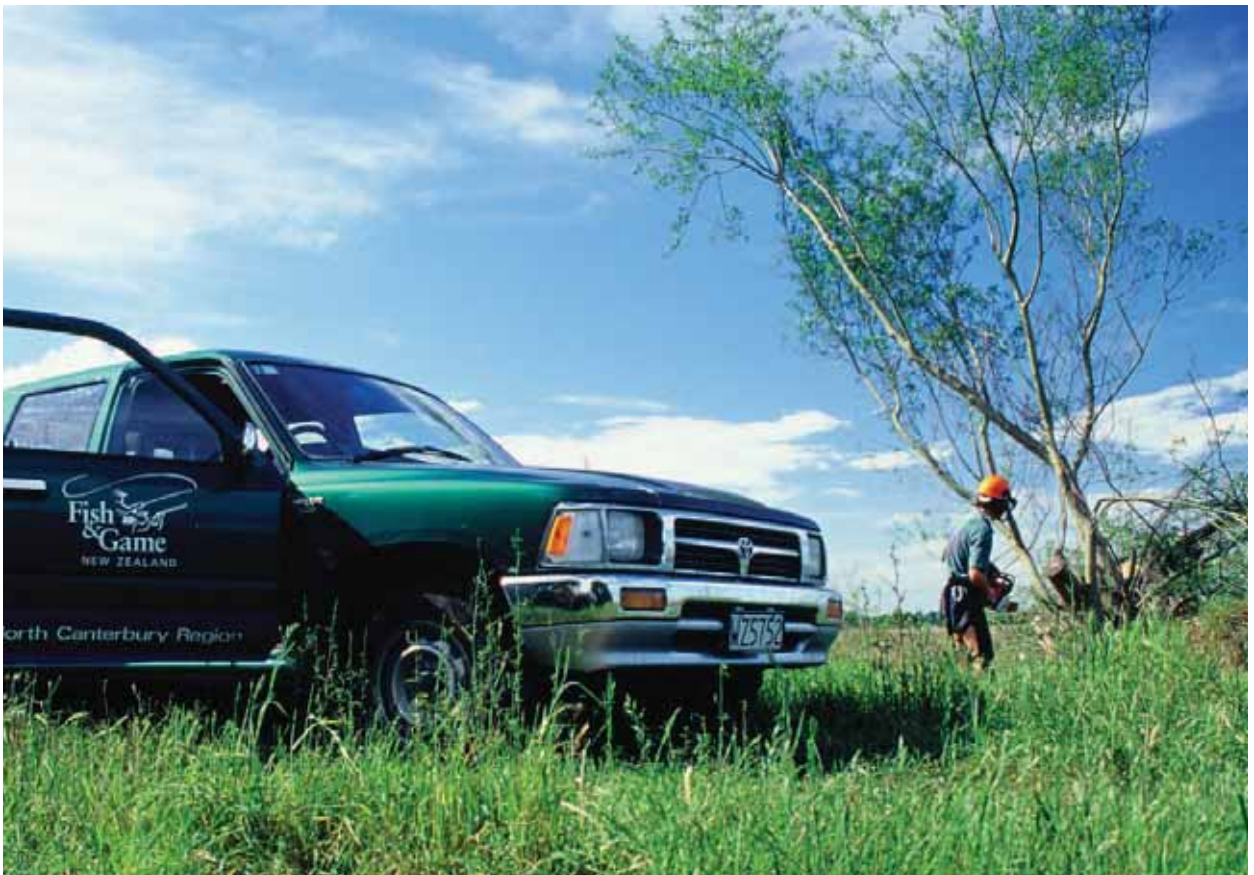
Photo One of the primary actions required to maintain, improve, and restore the natural lakeshore vegetation is the control of willows.

Taylor, K.J.W. (ed.) 1996. The Natural Resources of Lake Ellesmere (Te Waihora) and its Catchment. Canterbury Regional Council Report 96(7), Canterbury Regional Council, Christchurch.