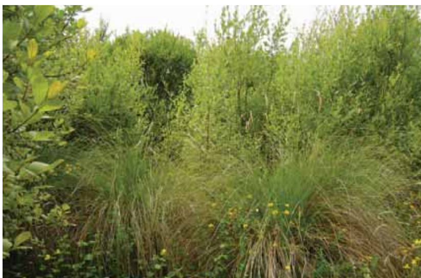
FIGURE 6. Grey willow invading tussock sedge ( Carex secta ) swamp near the mouth of the LII River.