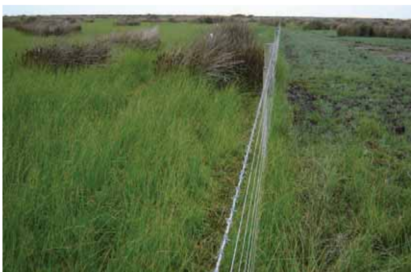
FIGURE 11. A fenceline at Kaitorete Spit illustrates effects of grazing on three square sedgeland.