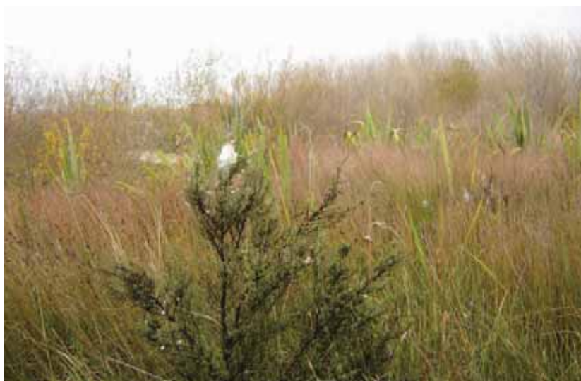
FIGURE 5. A distinctive native freshwater vegetation type: Baumea rubiginosa restiad rushland with scattered flax and manuka ( Leptospermum scoparium ), at Lakeside Reserve on the western shoreline.

Clark and Partridge (1984) listed several lakeshore areas as having high botanical value. Greenpark Sands, Kaitorete Spit, the west bank of the LII River and Yarrs Flat Wildlife Reserve retain the values that caused them to be identified as botanically