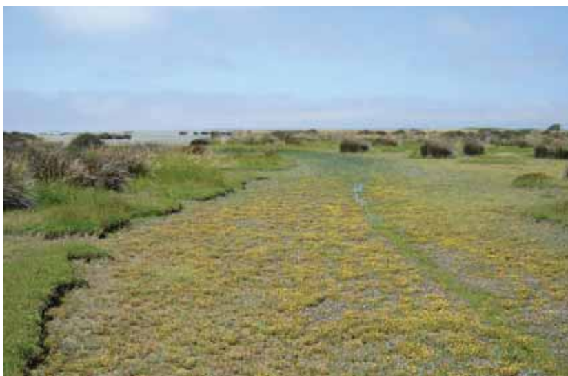
FIGURE 9 An example of the effect of even small differences in elevation on the distribution of lakeshore saltmarsh vegetation.

an important component of the lakeshore environment. They include significant examples of regionally uncommon and distinctive vegetation types, e.g., Figure 5, and are critical habitat for a number of rare/threatened plant and bird species.