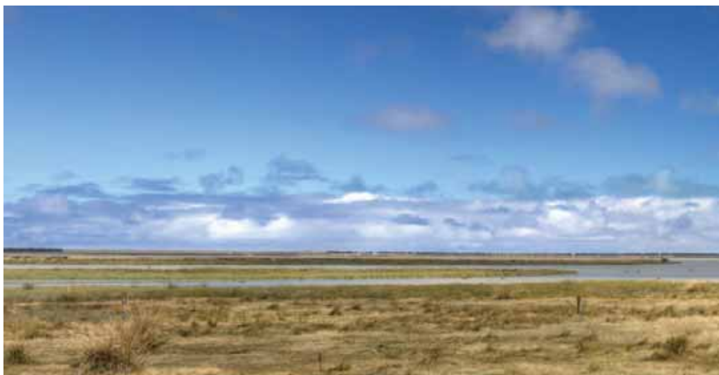
Photo A typical view of Te Waihora/Lake Ellesmere lakeshore vegetation illustrates the influence of fluctuating water levels and salinity on vegetation patterns. Much of the present nationally-significant lakeshore vegetation has developed under the artificial lake opening regime of the last 150 years.

In 2007, some additional sites of wetland vegetation outside the original survey area were mapped. These additional mapping units were not included in the spatial analysis of trends in the vegetation 1983-2007, and are not discussed further here. For some of the lowest-elevation