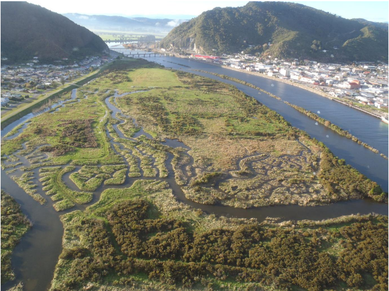
Figure 2. Grey River and Cobden Island floodplain restoration site, June 2016.