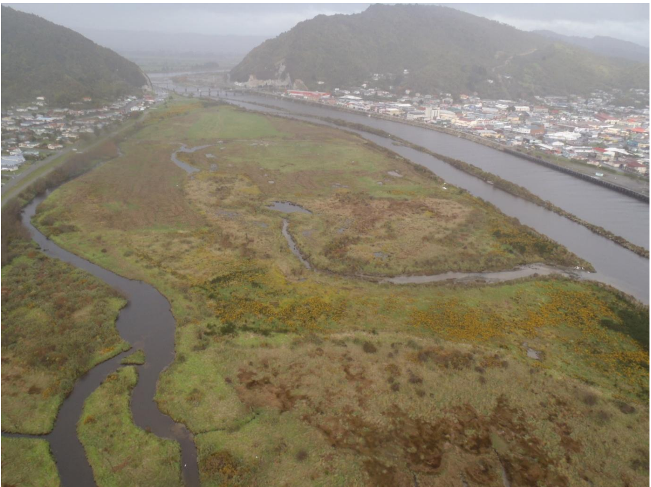
Figure 1. Grey River and Cobden Island floodplain, September 2011 (pre-restoration).

Ecological restoration of Cobden wetlands commenced in 2013 with the first of four annual stages of channel excavations on Cobden Island (Figures 1 and 2). The aims were to provide restored habitat for īnanga including improved spawning habitat in areas inundated on spring high tides. Over 10,000 flaxes and other indigenous species have been planted by volunteers beside the channels in order to provide shade, habitats for indigenous birds, and for aesthetic reasons. Volunteers have also carried out the more difficult task of removing gorse and broom from waterway margins in order to ensure the establishment of riparian plant communities known to support īnanga spawning.