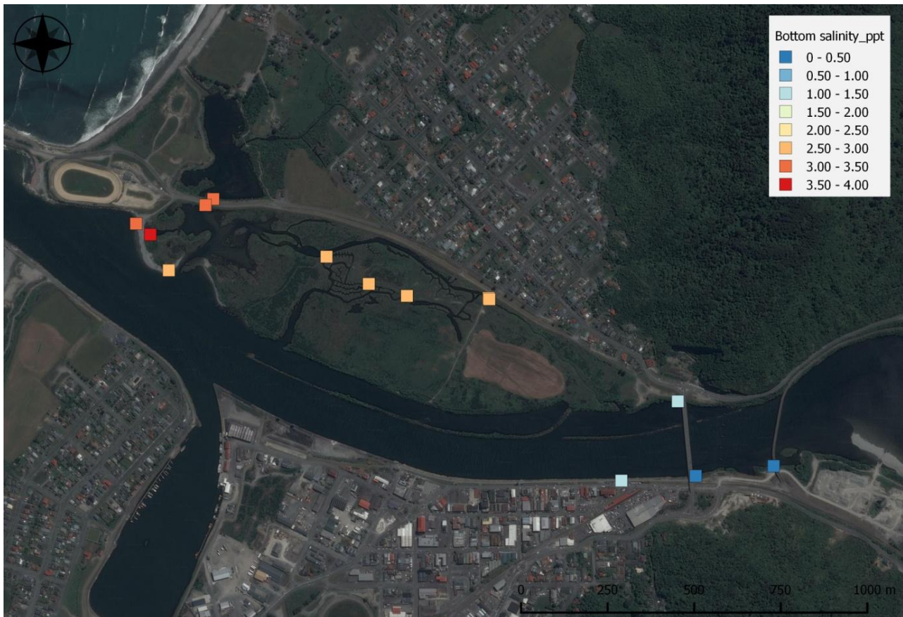
Figure 3. Bottom (maximum) salinity measurements recorded 1 May 2017 on the tidal peak (3.2m high tide @ 3.11pm)