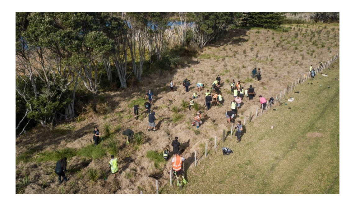
Riparian planting by a dune lake