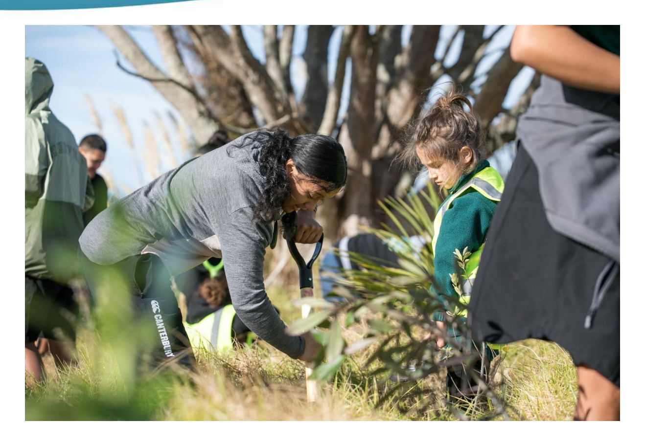
Enviroschools planting at Lake Waiporohita. See <a href="https://enviroschools.org.nz/">https://enviroschools.org.nz/</a>