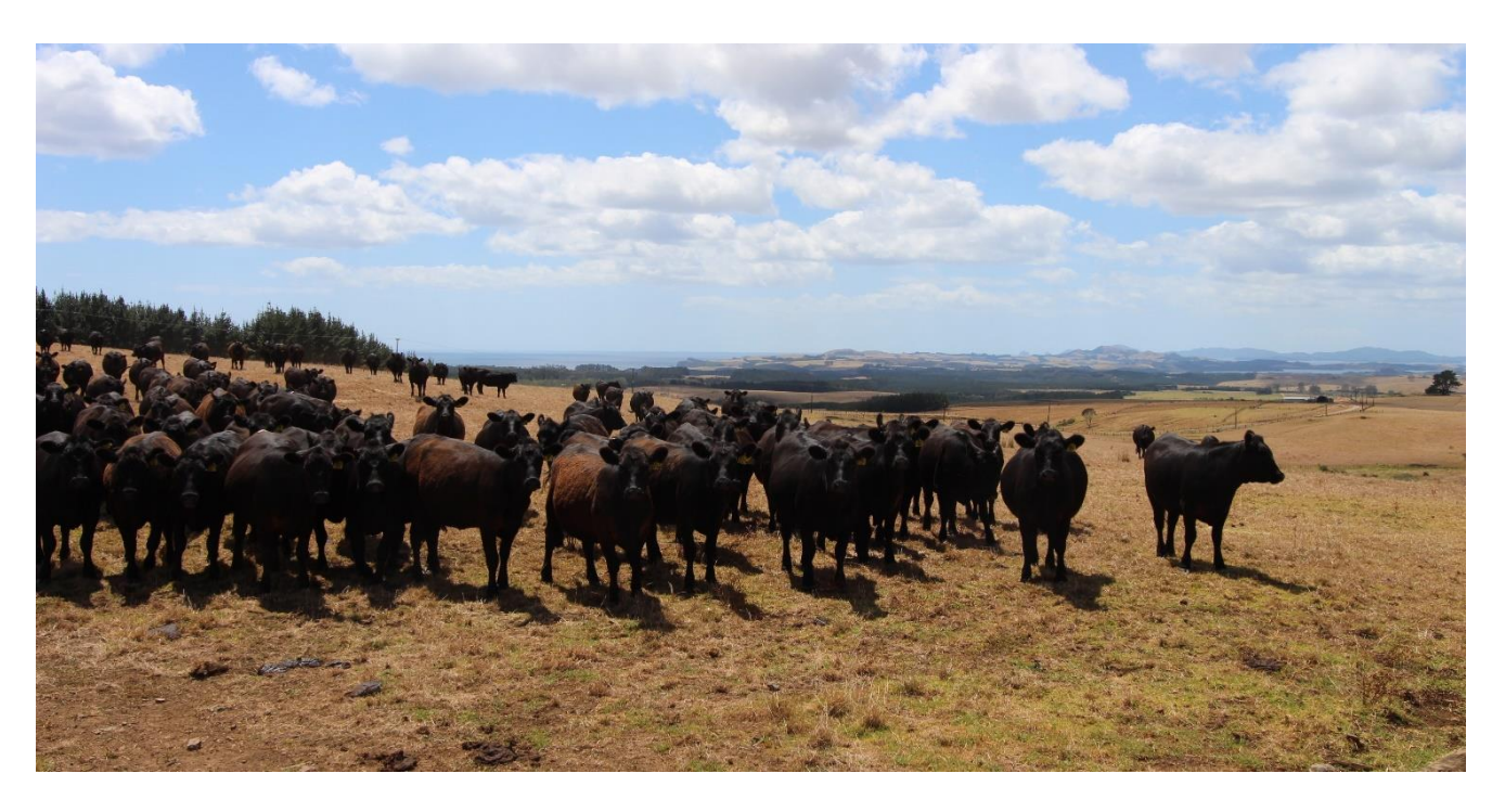
Drought, Takou Bay area

There is an opportunity to support early drought responses and long-term water resilience by providing better information, and through the use of models such as drought forecasting. We could include research on the interaction between population growth, water extraction demand, groundwater recharge, and sea level rise to improve understanding of water availability in coastal townships and agricultural regions. Ongoing investments in infrastructure to improve the reliability of town water supplies will be necessary to mitigate drought risk. In addition, demand reduction measures, including community education, are likely to be required.