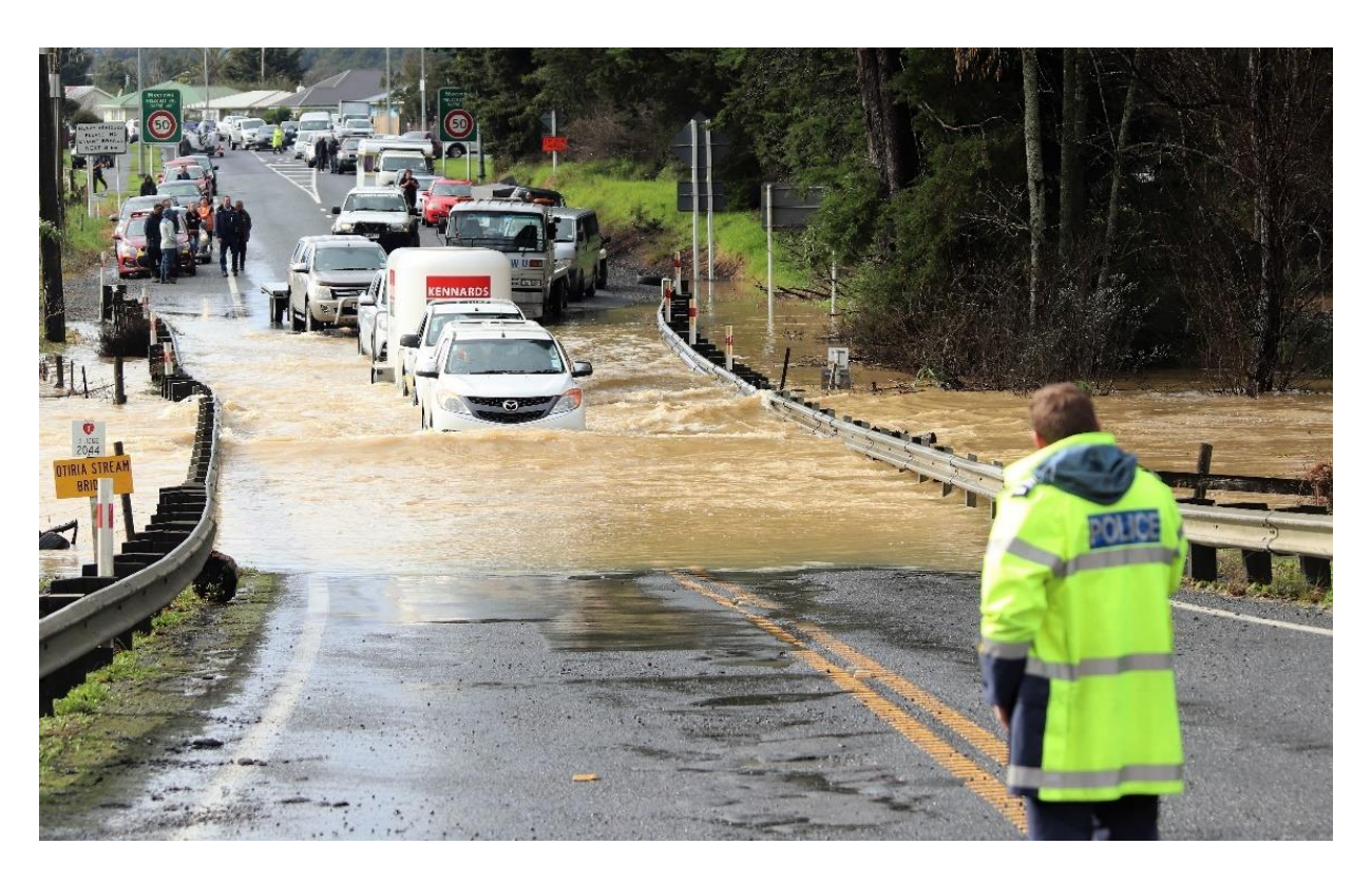
Turntable Hill flooding

While climate change projections are built into specifications for new assets, the existing stock of aging infrastructure is unlikely to be able to cope with the combined pressures of climate change, population growth and urban redevelopment. Retrospective upgrades of urban wastewater and stormwater networks to meet future needs are often prohibitively expensive.