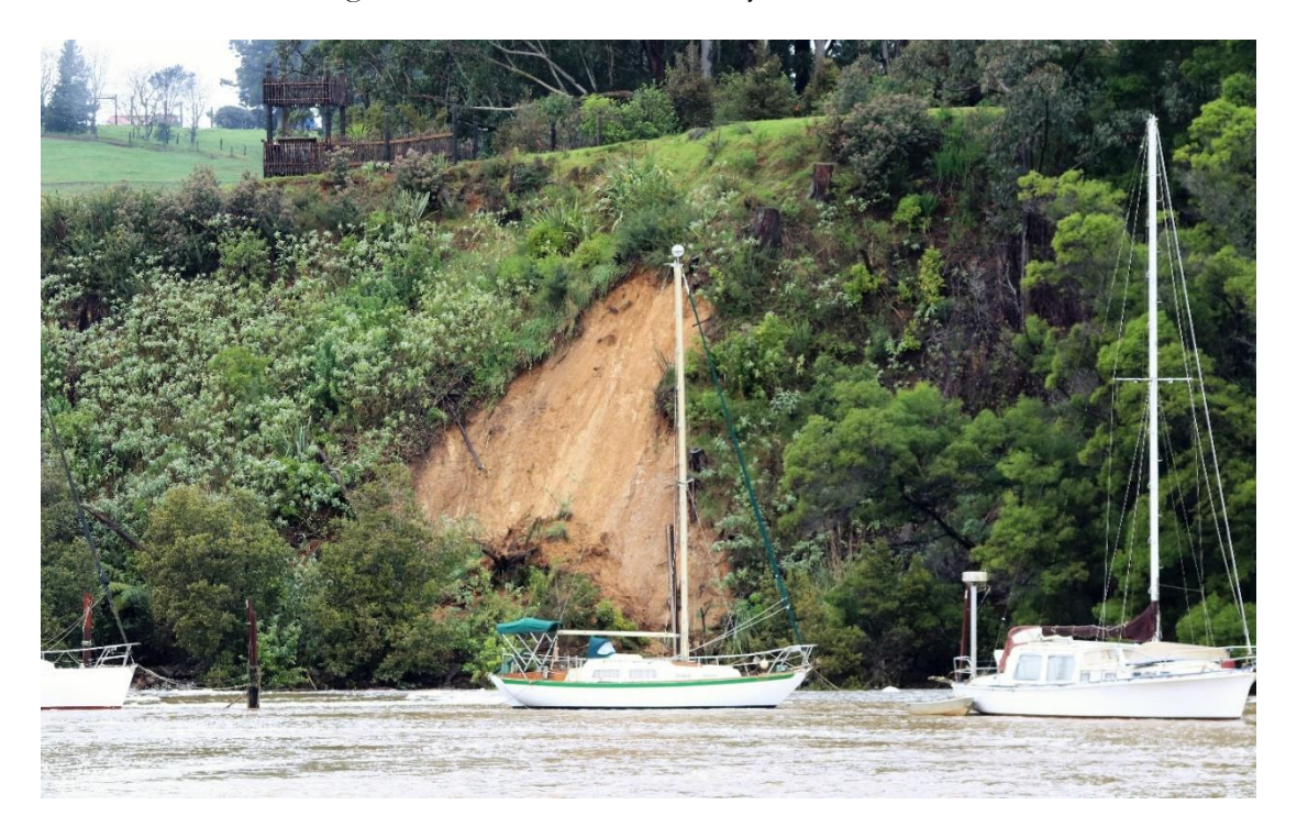
Coastal slip at Kerikeri Basin, below pā site