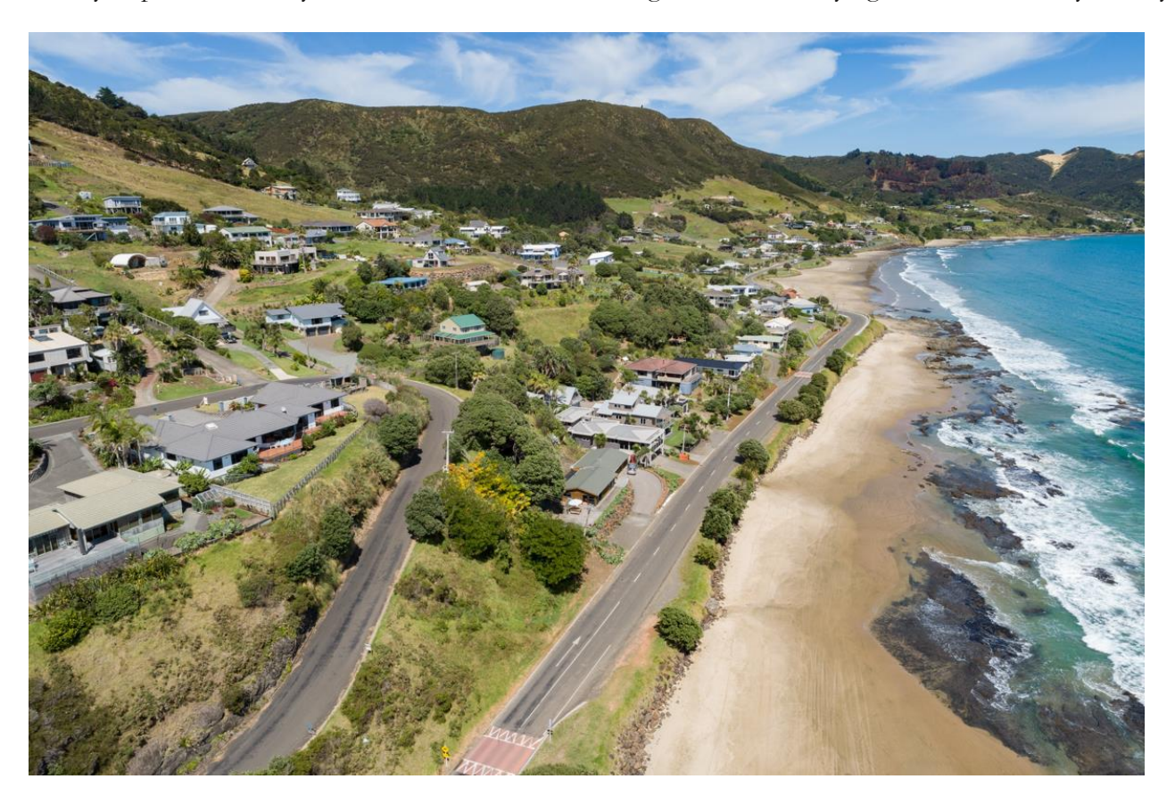
Tasman Heights, Ahipara

Most coastal communities do not have town water supplies, with households relying on tanks and shallow bores. Both of these sources of water will come under pressure with climate change due to increased drought and sea level rise. These communities are also often reliant on septic systems. Rising groundwater levels could impact on the effectiveness of waste disposal systems. Sea level rise will impact coastal agricultural areas as groundwater salinity impacts the ability to draw water for stock or irrigation, and low-lying land is affected by salinity.