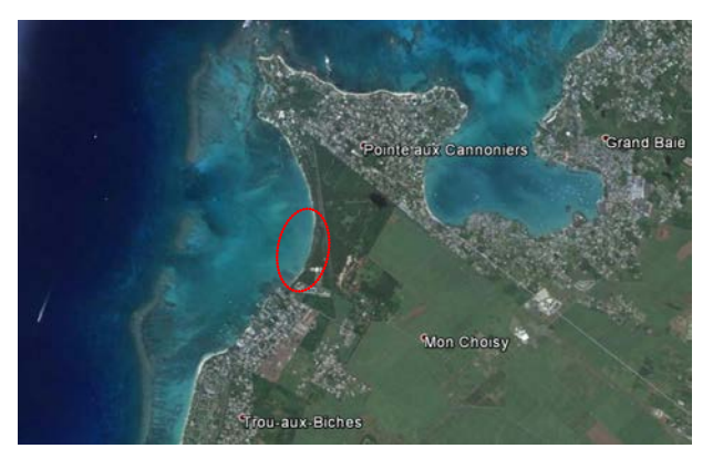
Figure 7 Location map of the project site at Mon Choisy Beach, Mauritius.

The Government of Mauritius secured a grant from the Adaptation Fund (administered by the UNDP) for the implementation of the project "Climate Change Adaptation Program in the Coastal Zone of Mauritius". The overall goal of the program is to assist developing countries that are party to the Kyoto Protocol that are particularly vulnerable to the adverse effects of climate change in meeting the costs of adaptation projects and programs in order to implement climate resilient measures. Two demonstration sites are included in the project; here we consider one of them, Mon Choisy Beach in north-western Mauritius (Figure 7).