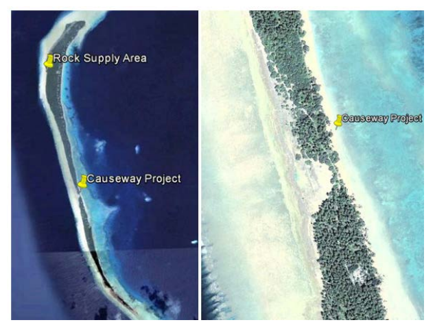
Figure 4 Location of the project site and potential construction material area. (Source: Google Earth).

As is the case with many problem locations, construction of causeways is a measure that can be applied to 'buy time' while long-term adaptation strategies are developed. In situations such as the Marshall Islands, where much of the available land areas are already vulnerable, this presents very difficult decision-making.