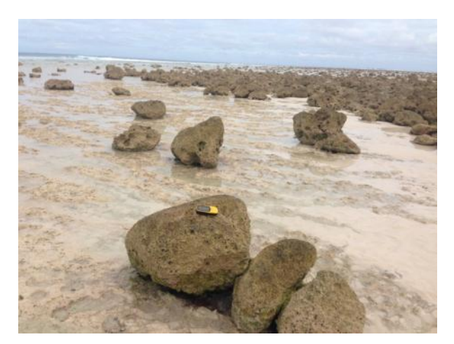
Figure 5 A large supply of rock is available on the north-western coast of Woja Atoll. The rock in the foreground is approximately 1.1 m diameter).

coastal hazard assessment and determining the volume of material and size of structural units required to construct a causeway able to withstand extreme events over the next 35-50 years, Investigations included visual and topographic surveys of the study area and inspections along both coasts of southern Woja Island. A survey of the north-western coast of the island revealed an abundance of accessible large armour rock (Figure 5), as well as shingle suitable for use in construction as core and fill material. Ecological surveys (both marine and terrestrial) were conducted at the project site as well as at source sites for construction material.