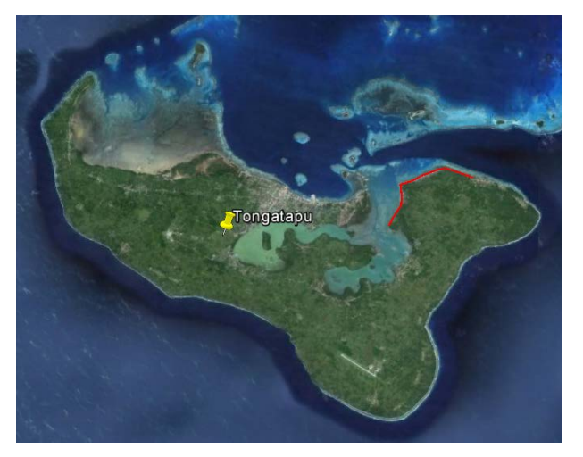
Figure 1 The study site (denoted by the red line), includes 5 coastal villages. Wave exposure decreases from east to west.

Fundamentally, the 'erosion problems' and 'vulnerability' of the villages in the study area are due to both the road and the villages being built too close to the coast on low-lying land. This in turn is compounded by human activities such as sand-mining, mangrove removal and reclamation, over-fishing and pig-foraging [12]. The wave exposure of the study site decreases from the eastern villages exposed to short period waves from the east, to the western villages which border the lagoon entrance.