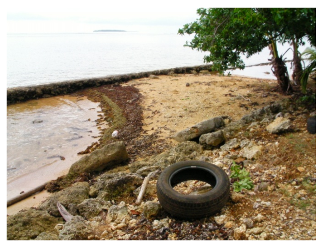
Figure 2 A tombolo formed in the lee of a failed seawall at eastern Manuka.

beach welds onto the shoreward side of the breakwater), since there is little to no down-coast beach in this location, just seawall, and so further negative impacts were not an issue. On temperate coasts, tombolo formation occurs when the ratio of the length of the breakwater (B) to the distance of the breakwater off of the existing coast (S) is >0.67 [6] through to when the B/S ratio >1 [15].