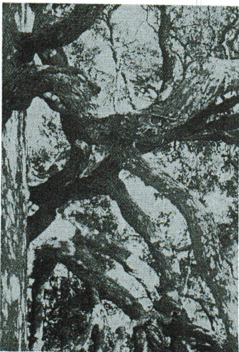
Gnarled with age, but magnificent: 40m across and 10m high