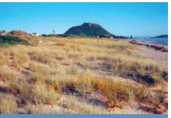
Marine Parade buffer. Suitable width and natural vegetation offer sustainble security

With the threat of global warming and potential sea level rise of between 30 to 50 cm over the next 100 years, it is even more important than ever to ensure that our dunes are able to function naturally.