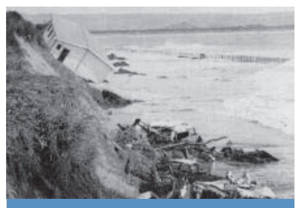
Ohiwa 1976 erosion. The buffer here was too narrow to cope with natural processes.

1. Be wide enough to cope securely with the normal storm and calm weather cycles.