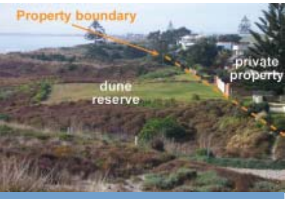
Private occupation of public land

Plants on the following list must be the ONLY ones used on our public coastal reserve areas, and then ONLY after discussion with the landowners, i.e. the local District Council, lwi or