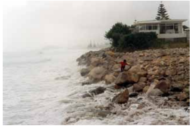
Shaw Road, Waihi Beach Coastal Protection No dunes = No beach