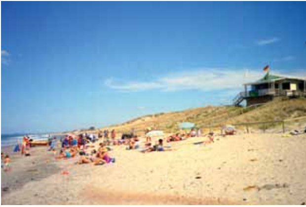
Pāpāmoa Domain Coastal Protection. Native coastal plants protect dunes. Good dunes = Great beach