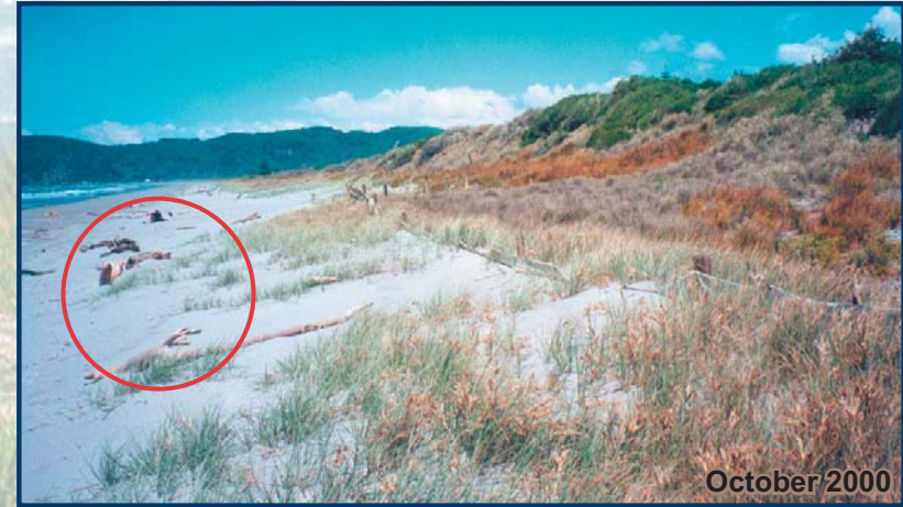
Four years after planting, the fence disappearing.