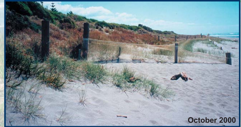
The original planting is effectively trapping sand. New posts were placed at the base of the steps as old ones became buried.