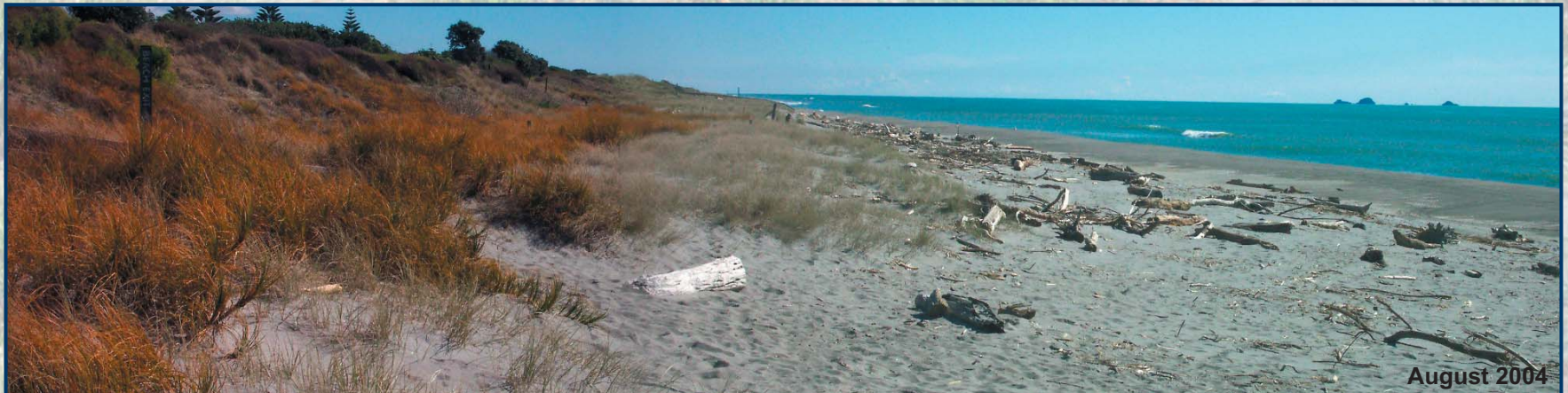
Continuing sand accumulation is raising front dune height, burying the fence and improving beach width.