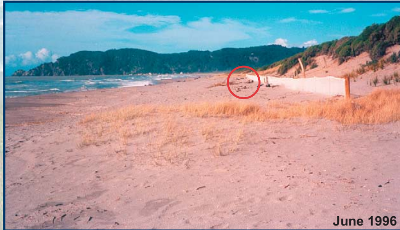
Before planting commenced.