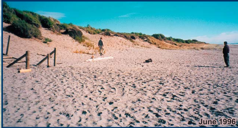
Casual pedestrian impact at Pacific Parade Access.