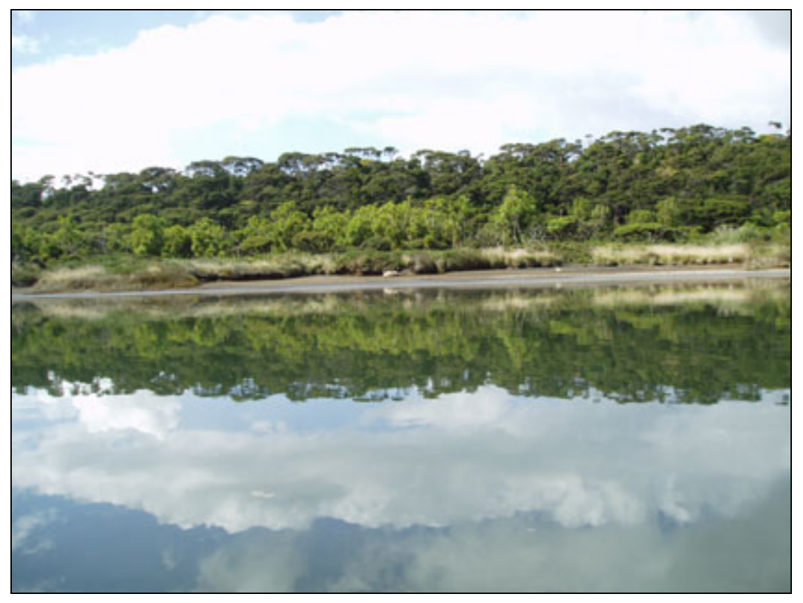
Figure 4: On the southern side of Motutere Island bay the saltmarsh edge grades into cabbage tree swamp and then into kanuka forest . 24/2/05