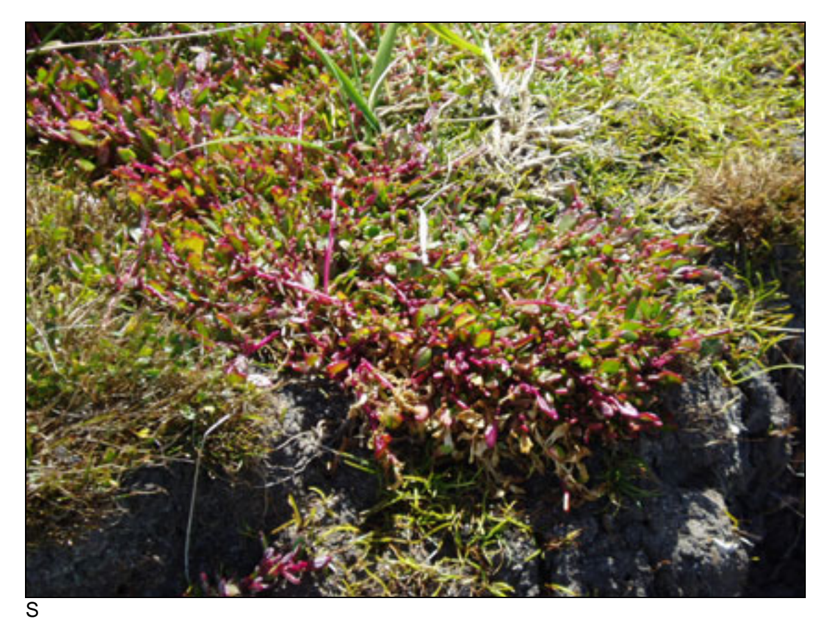
Figure 9: Sea meadow turf along the eroding rush edge East of Mowhiti Point. Species present in this zone include Lilaeopsis ruthiana, Ranunculus acaulis , slender clubrush, Lobelia anceps? (fleshy pink form) and tall fescue. 25/2/05