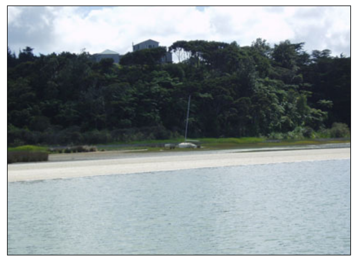
Figure 10: There are a variety of estuarine/freshwater communities around the sandspit west of Kainamunamu Stream. The catamaran is sitting on a patch of short spartina that extends out of the picture to the right. 25/2/05