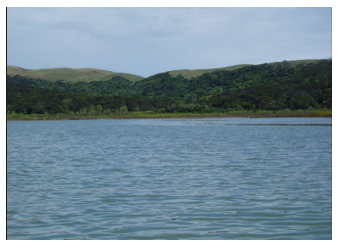
Figure 5: Saltmarsh backed by freshwater wetland (marsh clubrush/raupo/flax/cabbage tree) and coastal dune forest south-west of Piritoka Point. 24/2/05