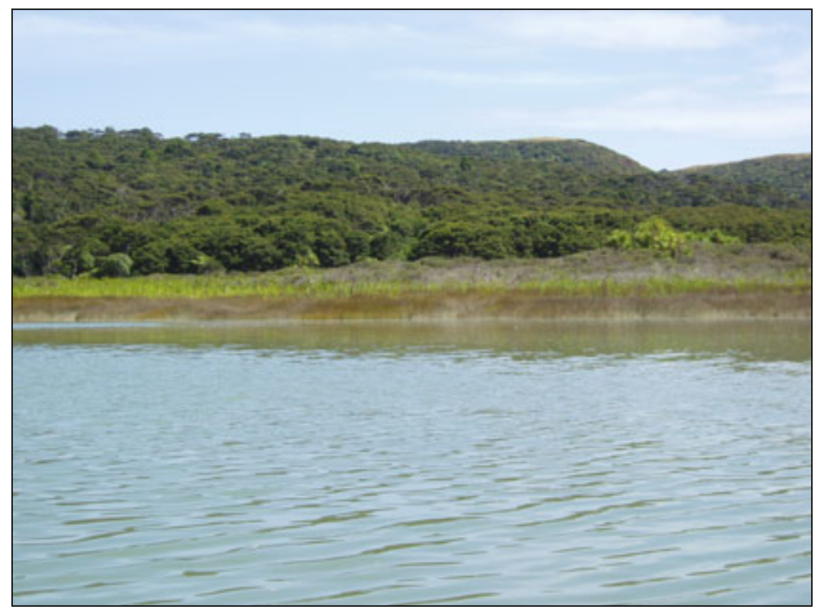
Figure 6: Saltmarsh backed by freshwater wetland (marsh clubrush/raupo/flax/cabbage tree) and coastal dune forest South-west of Piritoka Point. 24/2/05