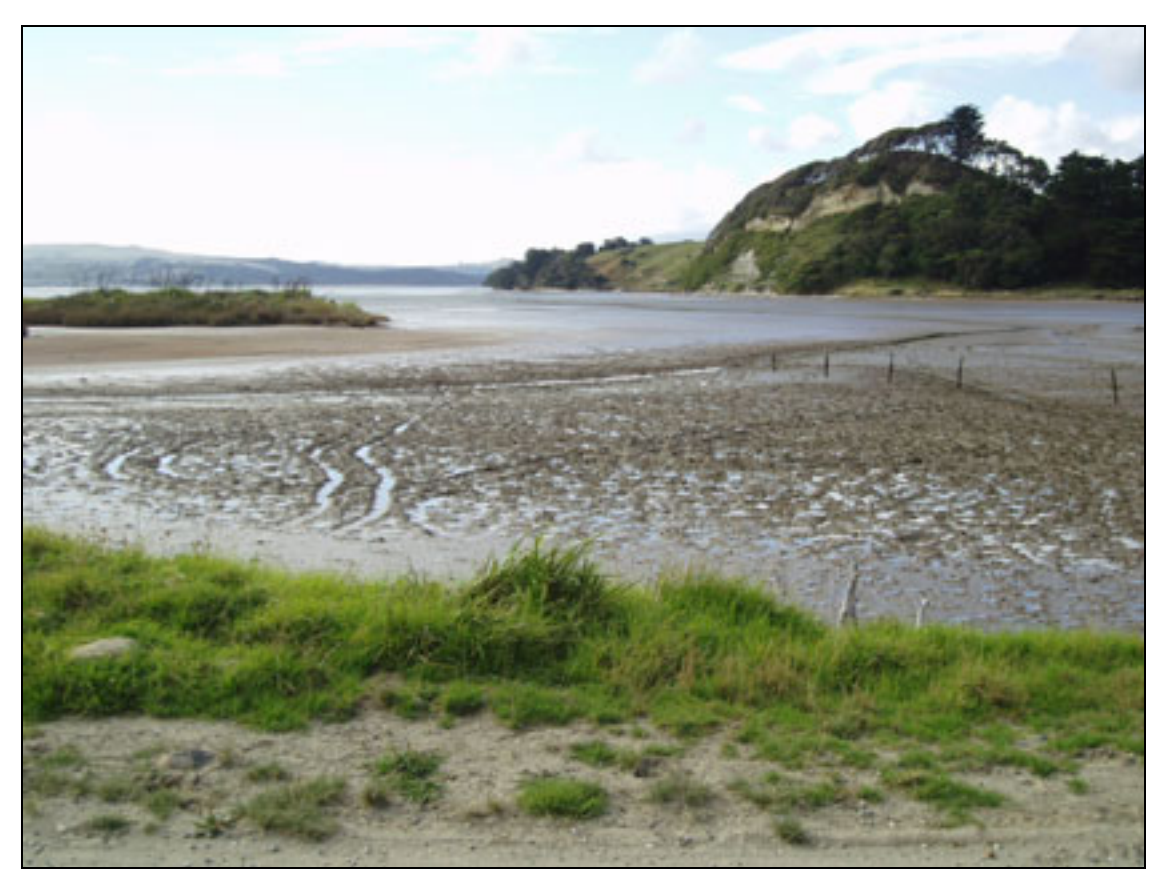
Figure 17: Stock and vehicle tracks on the mudflats of Opaku Bay.