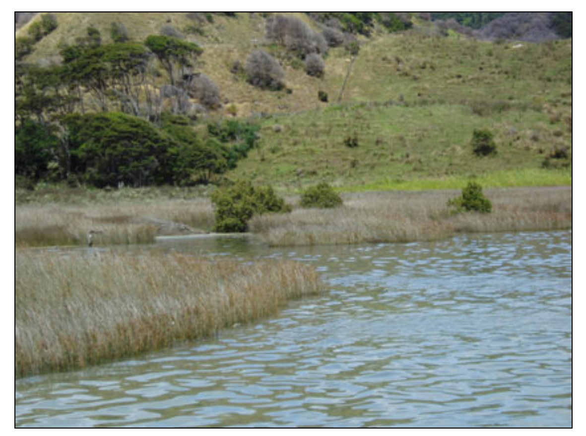
Figure 12: The largest area of sea meadow (entirely sea primrose) was found at the mouth of the Omaia Stream. It is underwater in the foreground adjoining the rush and mangroves. Note the saltmarsh ribbonwood (left), and marsh clubrush (right) inland of the sea rush. 26/2/05