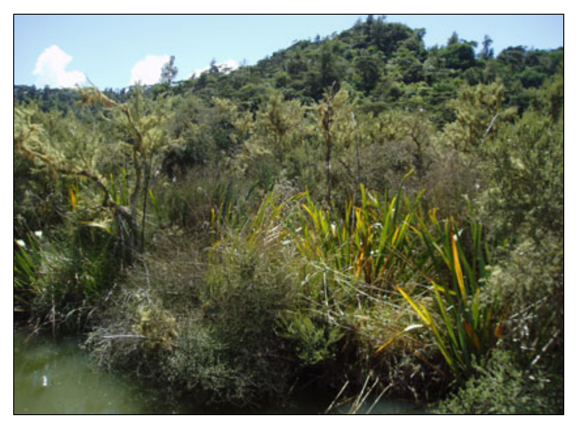
Figure 13: Saltmarsh ribbonwood, mingimingi, flax and blue-green rush line the lower Omaia Stream. Behind this edge is an extensive marsh clubrush /raupo wetland and coastal forest. 26/2/05