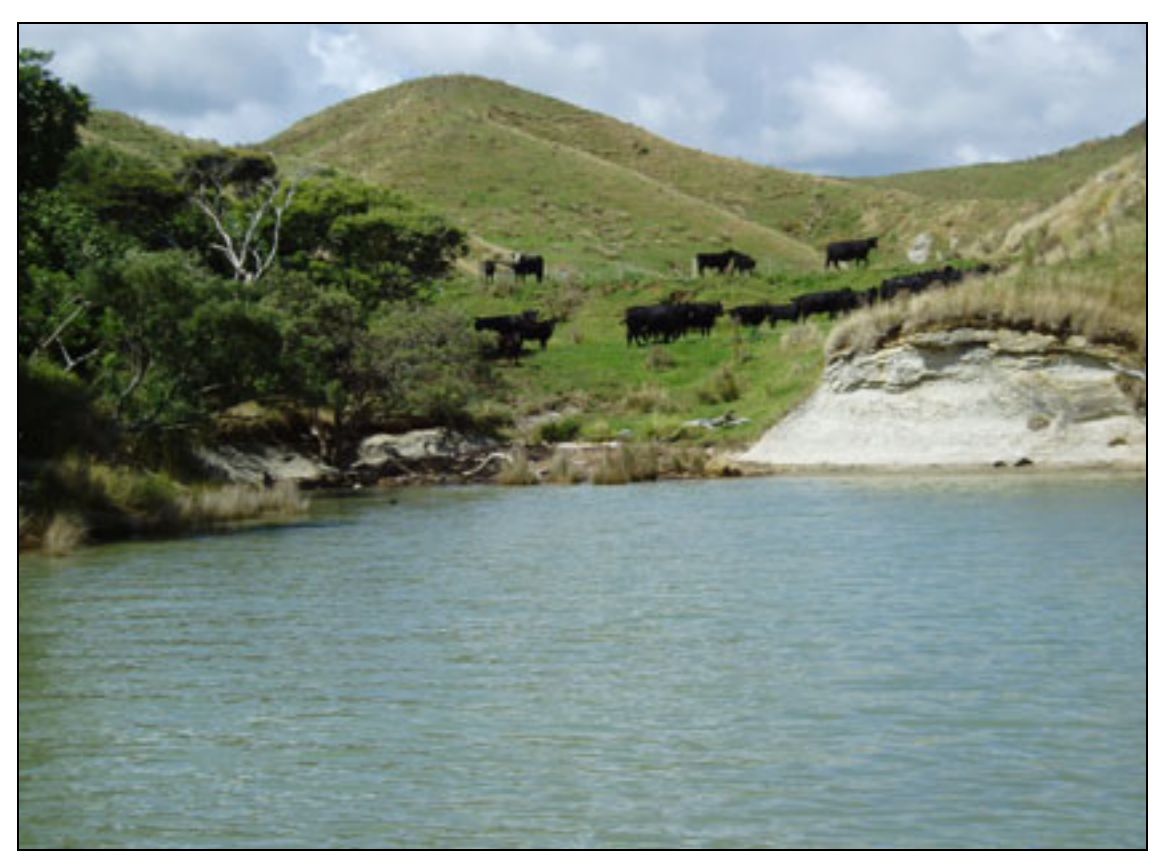
Figure 15: Stock access to the harbour edge is a problem around Ohau Point. The grazing of the understorey means there are no young pohutukawa surviving to replace the present old trees. Some of these existing trees are dying due to possum browsing. 26/2/05