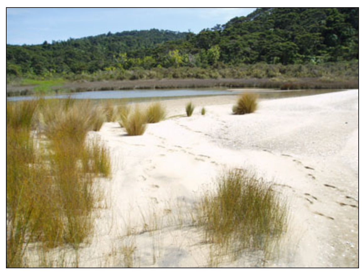
Figure 7: Te Puhi Point lagoon with a band of coastal shrub daisy between the sea rush and coastal forest. 24/2/05