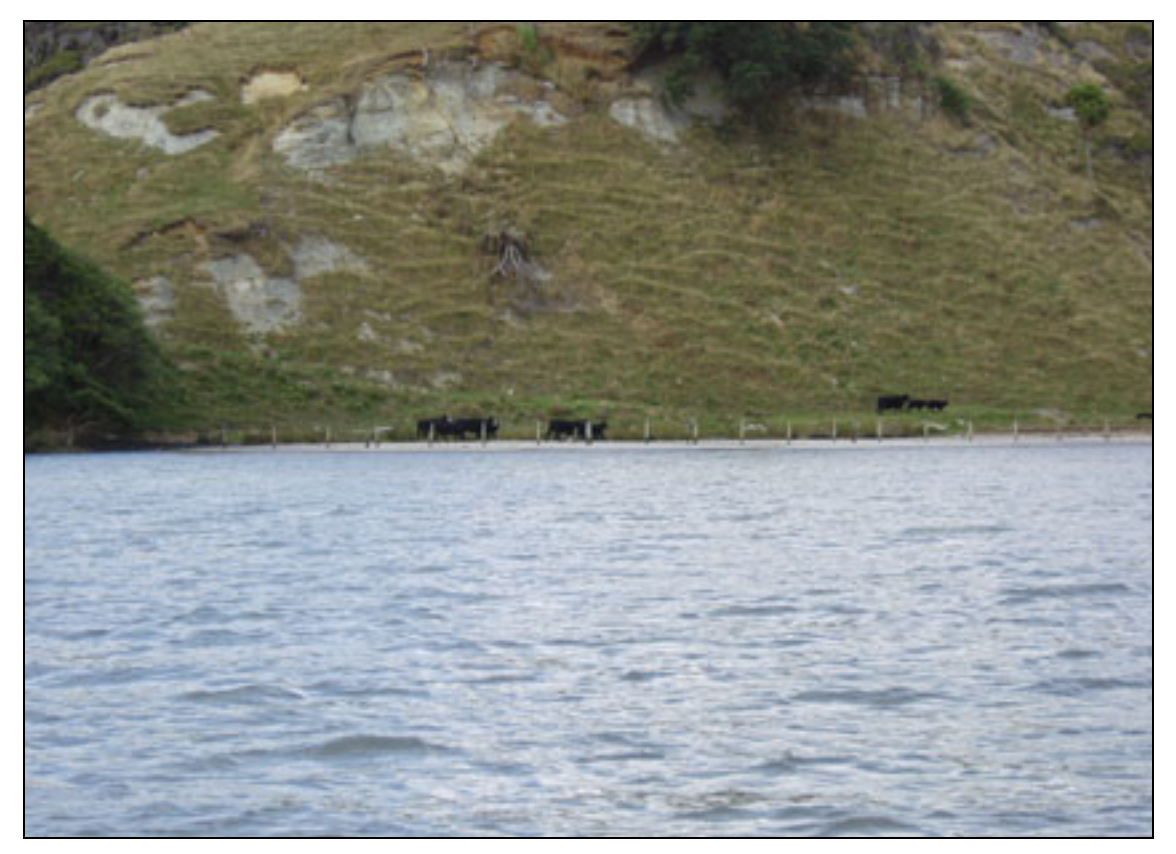
Figure 14: Stock access to the harbour edge is a problem around Pukerau Stream. The upper end of this bay is also heavily infested with saltwater paspalum. 26/2/05