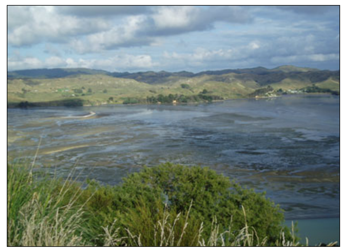
Figure 2: A view from Tahuri Point over the seagrass beds towards the farmed catchment between Ruakotare Point and Okapu. Note the spatial patchiness of the seagrass beds. 26/2/05