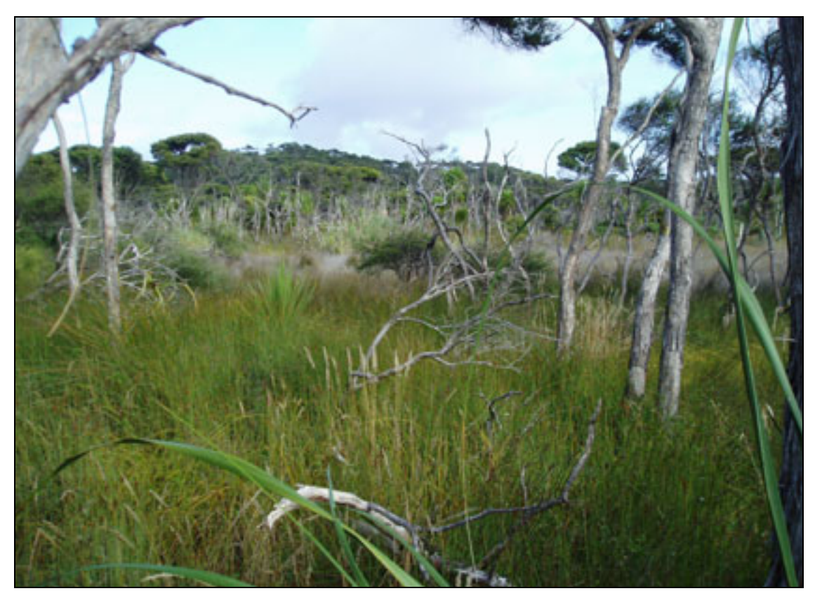
Figure 3: A view through a narrow ridge of manuka/knobby clubrush to the upper reaches of one of the sea rush/oioi/Baumea arms at Rauiri Head. 24/2/05