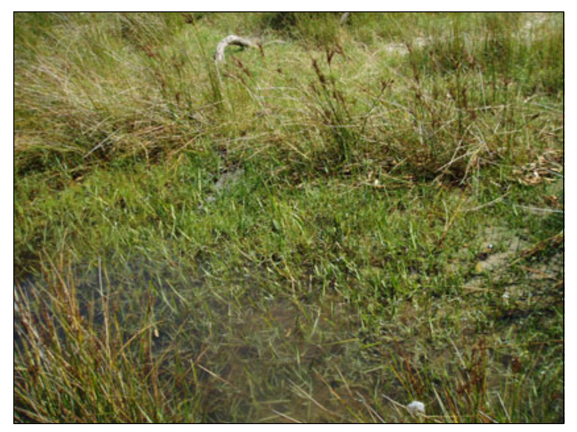
Figure 16: Saltwater paspalum is mixed with short spartina in a small embayment south of Ohau Point. 26/2/05