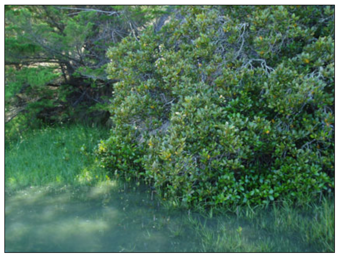
Figure 11: An adult mangrove and seedlings surrounded by spartina at Papatapu Stream. 25/2/05