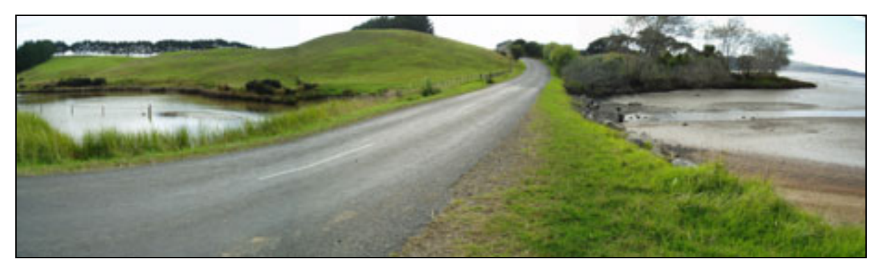
Figure 18: The perched inlet at the Aotea Road – Okapu intersection which drains (and fills) slower than the main harbour to the right. 27/2/05