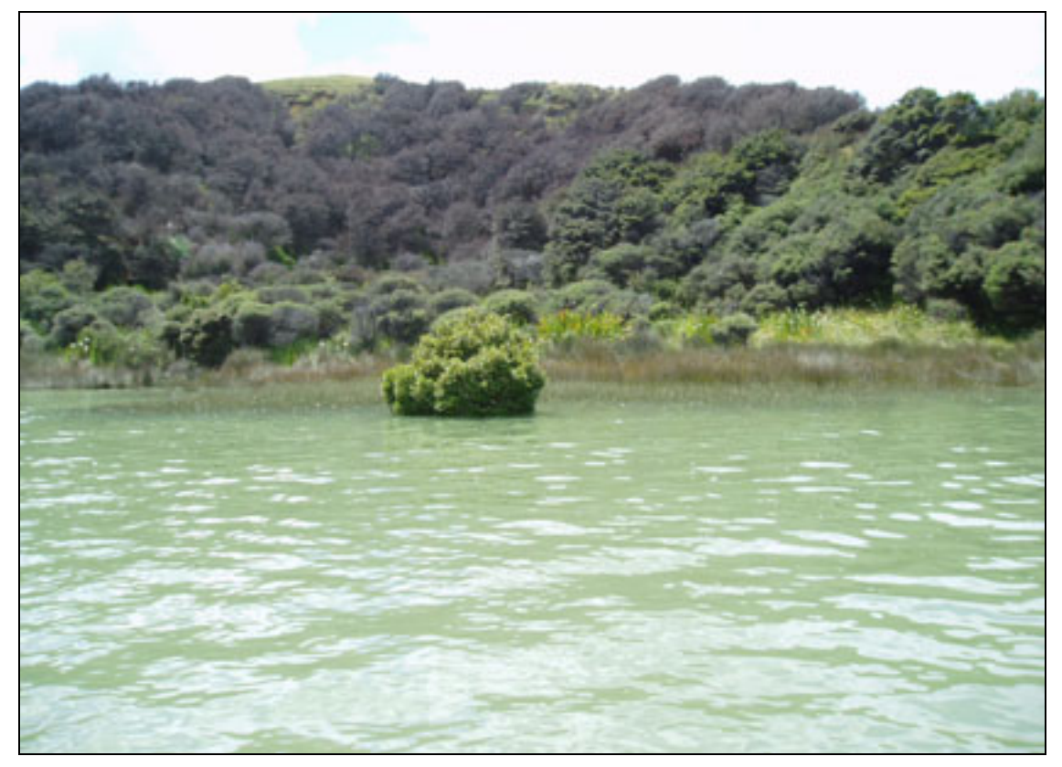
Figure 8: A mangrove upstream of Karetoto Island. Note the dead kanuka in the background, presumably from aerial herbicide spraying. 24/2/05