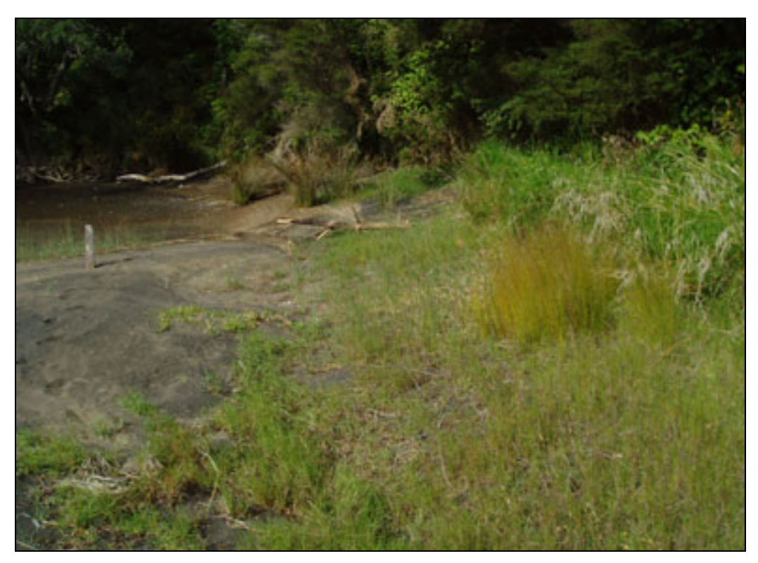
Figure 20: Saltwater paspalum dominates patches of oioi, sea rush and three-square on the southern side of Tahuri Point. 27/2/05