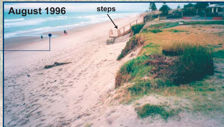
(low tide photo) The heavily modified "dune" front is very unstable. The now dominant Kikuyu grass is not able to perform the accretion function of native dune plants. Water from the Wairakei Stream system is visible on the beach in this photo. This water saturates the sand, making it very prone to erosion.

Wairakei Stream used to exit on the beach, but was blocked by developers at Marjori Lane. The front dune was destroyed by being bulldozed back into the stream to create more building sections. Karewa Parade is being formed by machinery in the white sand area to the left of Marjori Lane. Water from the stream system can now only reach the sea by flowing through the sand under the houses.