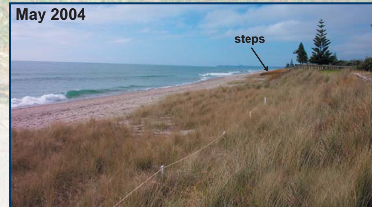
(high tide photo) The first year plantings did not succeed. Subsequent plantings of vigorous hardened-off plants in 1998 and 1999 have produced these results. Photo was taken after the impact of 10m waves from Cyclone Ivy in February. The restored front dune is now functioning reliably. Remnant Kikuyu will be replaced by native mid and back dune species.