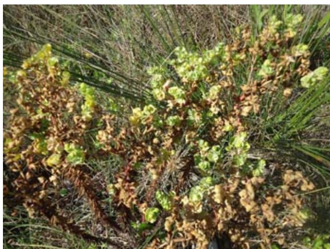
Euphorbia paralias : flowers and seeds. North of Aotea Harbour, West Coast, North Island, New Zealand, April 2012.

Sea spurge is native to western and southern Europe, but is widely naturalised in the coastal districts of southern Australia, and has also recently naturalised on Lord Howe Island. It is a weed of coastal environments and offshore islands and occurs on “free draining sandy soils on beaches, around estuaries, through dune fields, in coastal herbfields, grasslands, heaths and shrublands, and may also grow along rocky shorelines and in sand-filled cracks between rocks” ( http://keyserver.lucidcentral.org/weeds/data/03030800-0b07-490a-8d04-0605030c0f01/media/Html/Euphorbia_paralias.htm ).