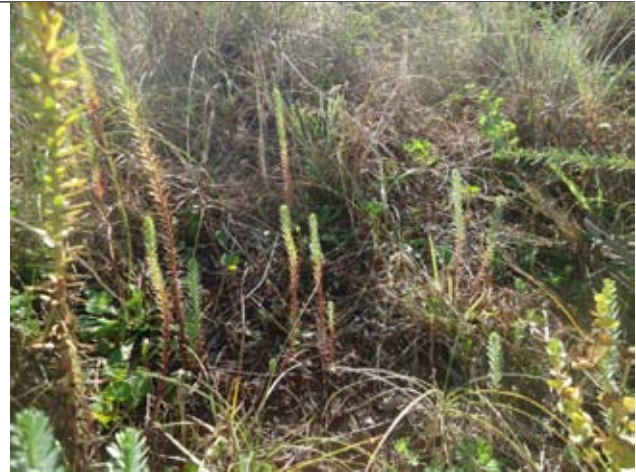
Euphorbia paralias north of Aotea Harbour, West Coast, North Island, New Zealand: seedlings within the largest patch. Photos: S.M. Beadel, April 2012.

The infestation site is obviously a site where items floating in ocean currents wash ashore. Piles of driftwood were present, along with miscellaneous plastic items. Three other weed species were also present: yellow flag ( Iris pseudacorus ), dimorphotheca ( Osteospermum fruticosum ), and alligator weed ( Alternanthera philoxeroides ). This is probably the southern-most alligator weed population in New Zealand.