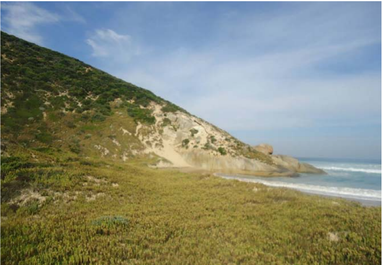
Extensive Euphorbia paralias infestation on the fore dune at Wilsons Promontory, Victoria, Australia. S.M. Beadel, April 2012.