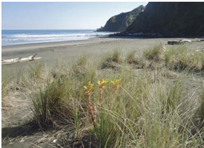
Euphorbia paralias : Single fertile plant about 50 m from the main infestation (since removed). North of Aotea Harbour, West Coast, North Island, New Zealand, April 2012.

One infestation comprised only one plant with several fertile stems, just on the boundary of the Aotea Heads Scientific Reserve. The other infestation c. 50 m to the north, just north of the reserve boundary, comprised c.65 flowering plants and over 100 seedlings, covering c.10×8 m. The age of the New Zealand population is unknown, but the larger patch has been at the site for at least two years, and probably at least 3–4 years. A specimen has been lodged in the Auckland Museum Herbarium (AK198572) and photographs are attached, including photographs from Wilsons Promontory National Park in Australia.