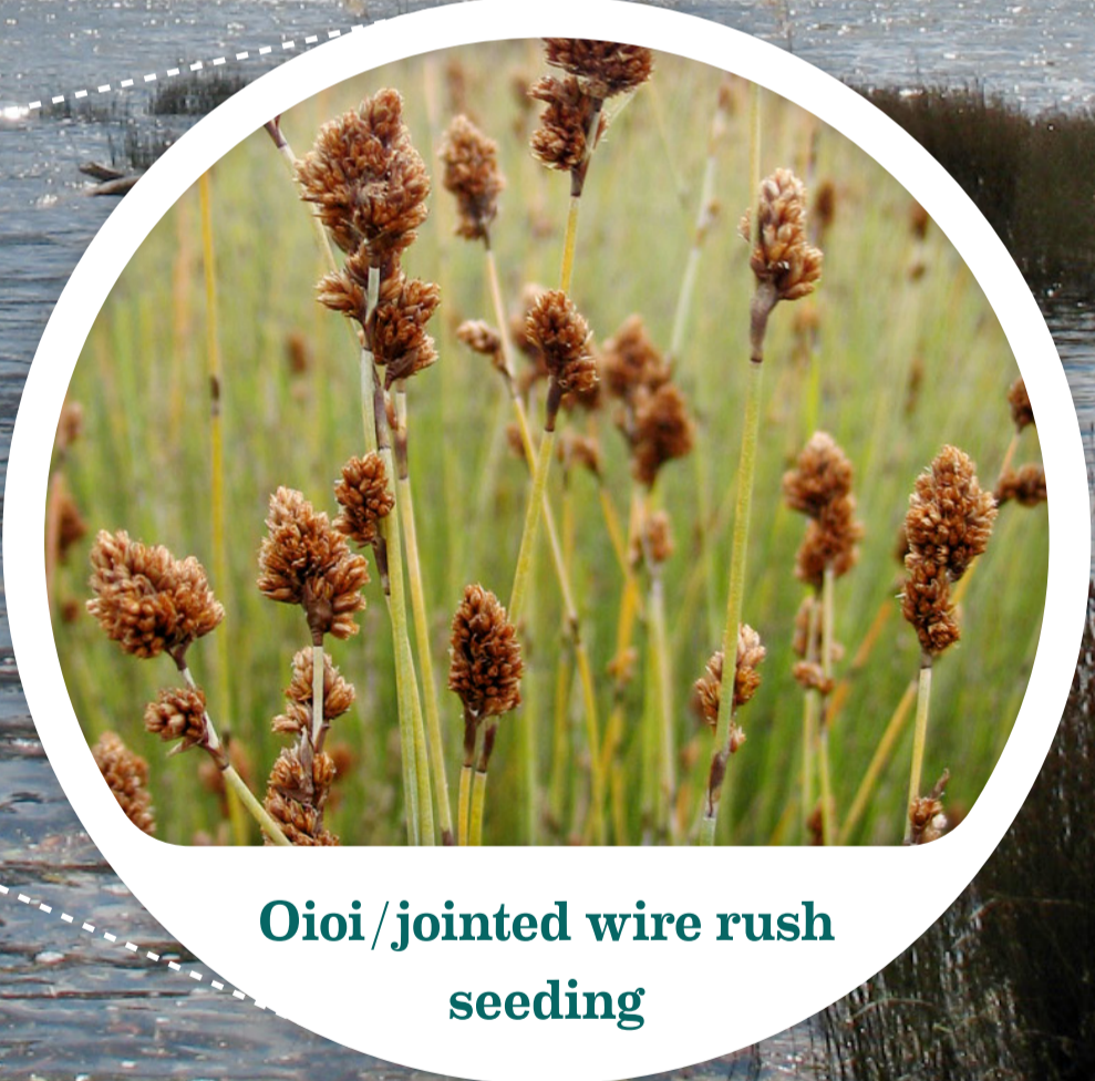
Oioi/jointed wire rush seeding