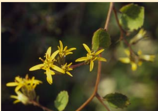
Brachyglottis sciadophila . Photo: Jeremy Rolfe.

Plant of the Month for May is Brachyglottis sciadophila . This is a neat daisy that grows as a slender liane, twining or tangling either over or amongst another plant, or creeping loosely along the ground. Its stems are woody, but slender and flexible, are hairy when young and grooved lengthwise. The thin leaves are rounded, 2–3 cm wide, with toothed margins and soft hairs on the upper and lower surfaces. Solitary yellow flowers can appear from October through to May.