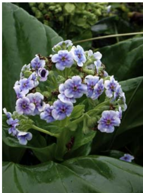
Nationally Vulnerable Chatham Island forget-me-not ( Myosotidium hortensium ).

The Network has hundreds of members worldwide and runs training courses, funds research through the David Given Research Scholarship, and runs the national online flora information system with more than 23,000 images of plants and species pages for close to 7000 plant species - see www.nzpcn.org.nz