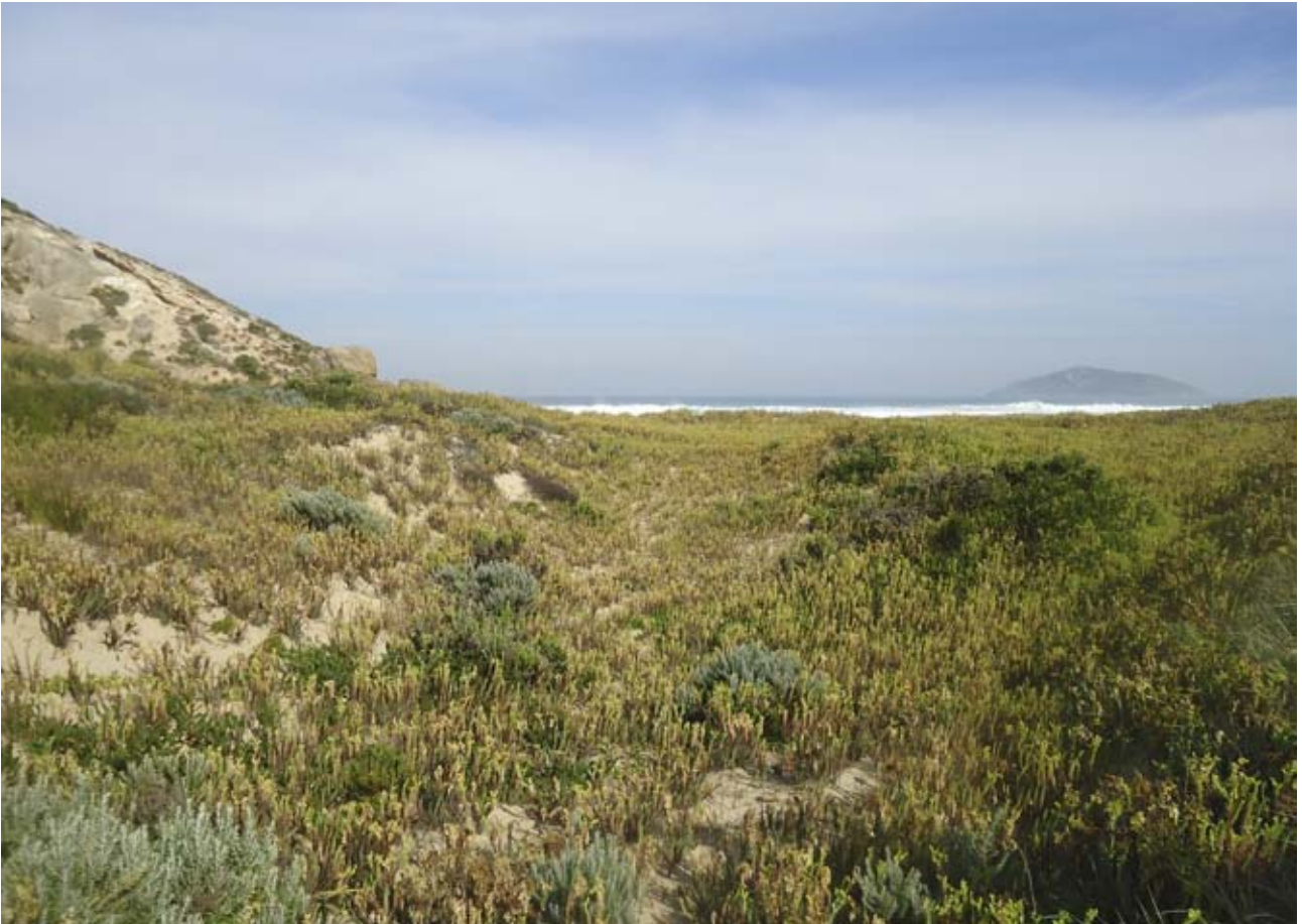
Extensive Euphorbia paralias infestation on rear dunes at Wilsons Promontory, Victoria, Australia