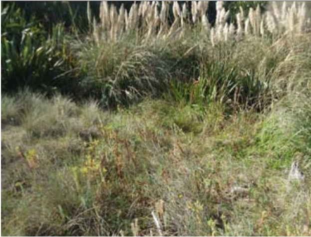
Euphorbia paralias north of Aotea Harbour, West Coast, North Island, New Zealand; the largest patch comprising c.65 fertile plants and over 100 seedlings. Note the yellow flag infestation in the background.