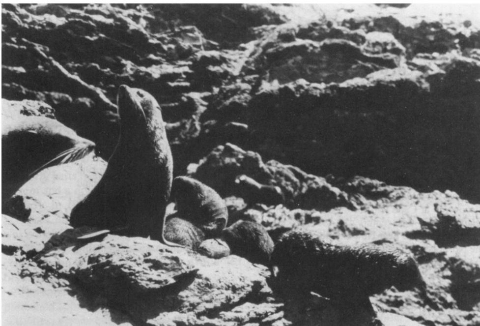
Fig. 1 – Cows and pups on the offshore rock stack, photographed during a visit by boat on 29 January, 1992. The cleft in which the pups were first observed from shore is to the right of the picture.

The colonies visited regularly are at Cape Terawhiti, Tongue Point, Sinclair Head, Turakirae Head, and Cape Palliser (see Fig. 2). Smaller colonies are visited less frequently.