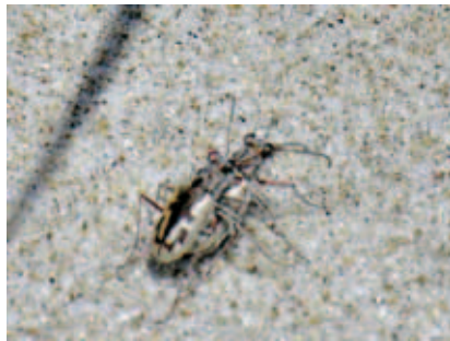
Fig. 13 – North Island, Northland, Uretiti Beach near Waipu: a mating pair of Neocicindela brevilunata.