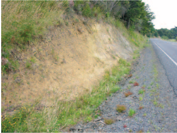
Fig. 1 – North Island, Northland, Hy 14 at 5 km E Kirikapuni: habitat of Neocicindela spilleri.