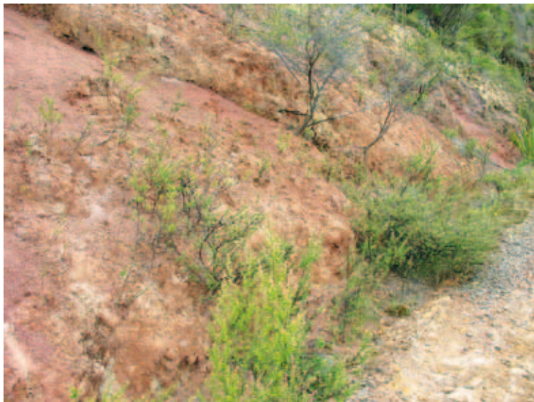
Fig. 2 – North Island, Northland, Hy 12, N of Baylys Beach jct nr Dargaville: habitat of Neocicindela tuberculata.