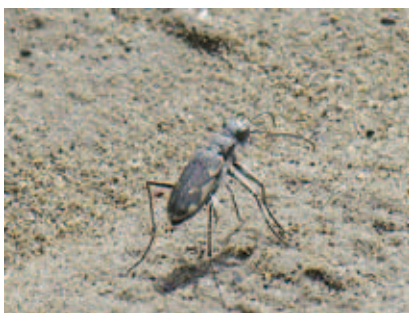
Fig. 3 – South Island, Marlborough, Wairau River: a specimen of Neocicindela helmsi.