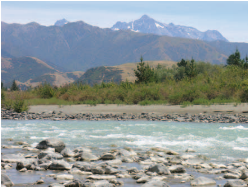
Fig. 5 – South Island, Marlborough, Clarence River: three tiger beetle species ( Neocicindela latecincta , N. helmsi and N. feredayi ) were found here.