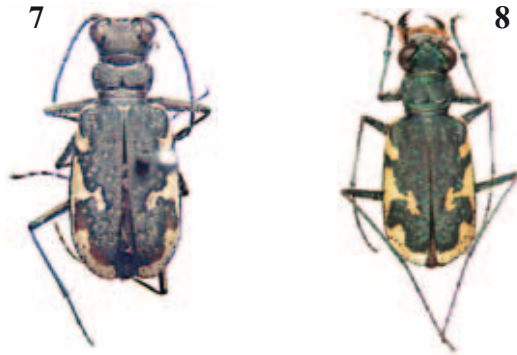
Figs 7-8 – Neocicindela novaseelandica (lectotype) (DEI) (photo: J. Moravec) (7). Neocicindela novaseelandica (syntype of Cicindela halli ) (BMNH) (photo: J. Moravec) (8).