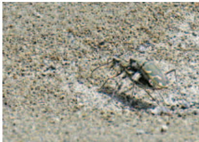
Fig. 11 – South Island, Marlsborough, Wairau River: a mating pair of Neocicindela feredayi.