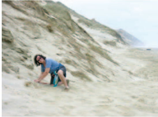
Fig. 12 – North Island, Northland, Bayllys beach: habitat of Neocicindela p. perhispidata.