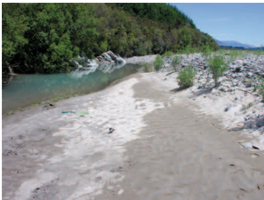
Fig. 4 – South Island, Marlborough, Wairau River: habitat of Neocicindela helmsi , N. austromontana and N. feredayi.