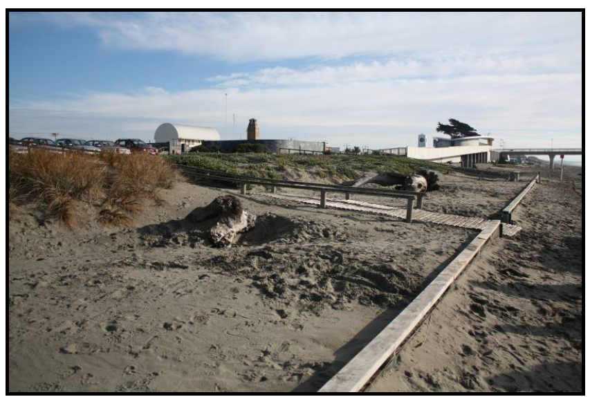
Accessways are critical for keeping beach users off planted sites. Spinifex has not as yet been planted here where pingao and ice plant have failed to maintain a vegetation cover along the toe of the foredune.

The heavily used carpark and New Brighton is to be planted in spinifex and pingao.