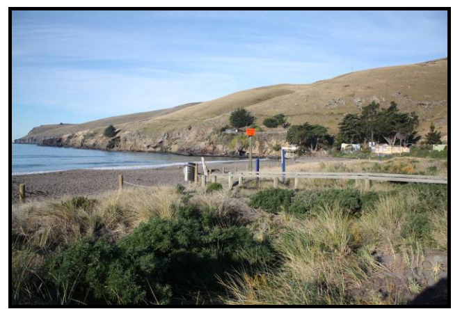
The semi-stable backdune remains dominated by exoitic species including marram grass and scattered patches of tree lupin.

This spinifex colony along the central section of Taylors Mistake has expanded from a planting trial established in 1996 and represents the first introduction of spinifex to the Canterbury region since it was last recorded in the 1940s. The front fence has been moved several times seaward to cope with the vigorous growth of spinifex.