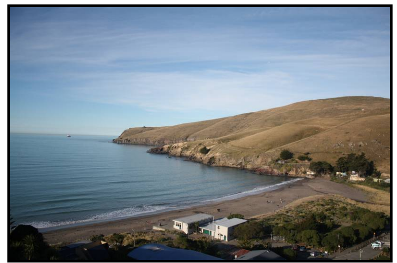
The relatively sheltered bay of Taylors Mistake provided the opportunity to successfully re-introduce spinifex in the mid-1990s to Canterbury since it was last recorded in the region some five decades earlier.