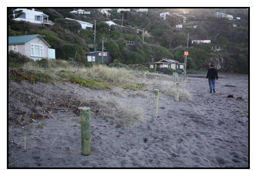
North of the Surf Club at Taylors Mistake planted spinifex has had to compete within a narrow zone with vigorous exotics such as ice plant.