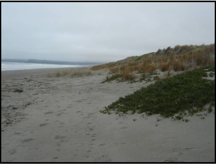
An 'outlier' of a spinifex-dominant incipient dune seaward of pingao and ice plant covered foredune.