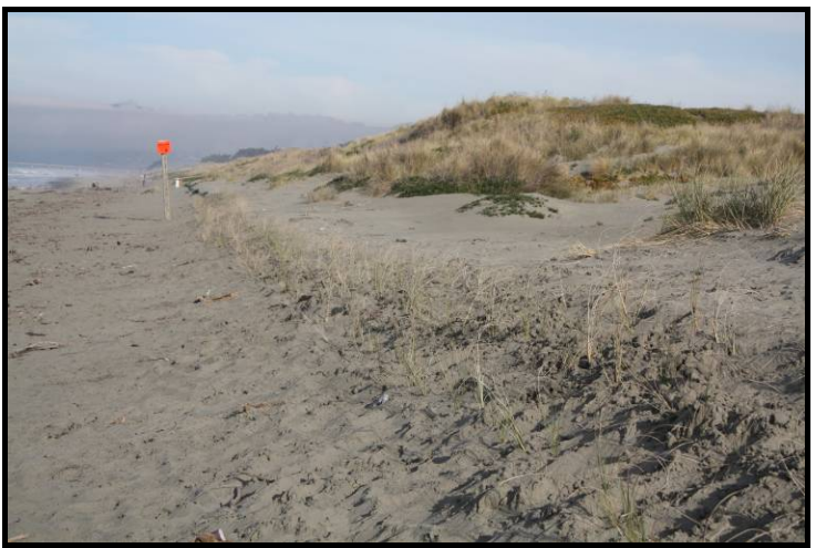
Up to five rows of spinifex were planted along the foredune and will be monitored for survival and growth. ECAN surveyed sand levels before planting and will continue monitoring at 6-monthly intervals as part of their permanent dune transect survey programme.

Spinifex seedling were planted by the Wai-ora Community group using best-practice guidelines including incorporation of slow-release fertiliser in deep planting pits.