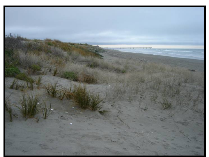
Spinifex in mixture with pingao and exotics on the landward side is less vigorous than the sward of spinifex more seaward.