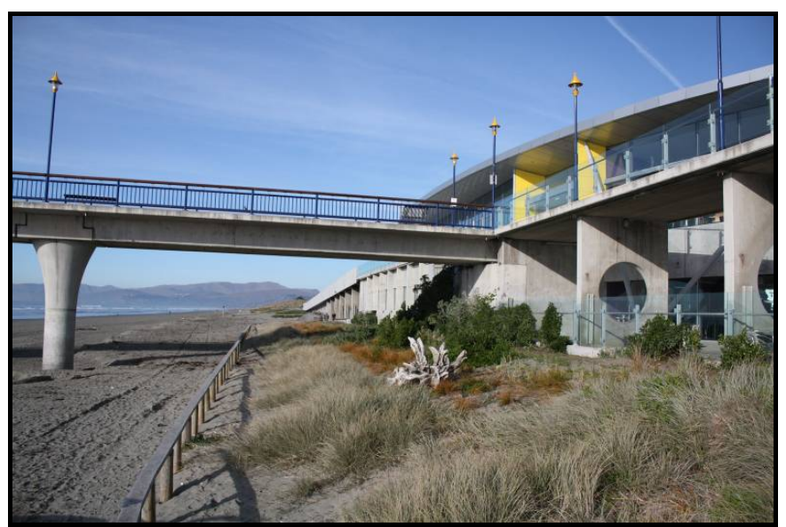
A dense zone of spinifex has successfully established along the heavily used foredunes adjacent to the New Brighton library and pier.