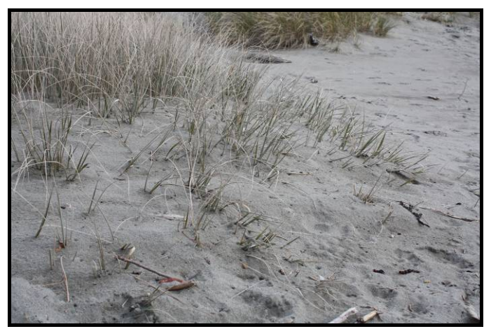
Rabbit damage evident especially on new growth of spinifex stolons that are extending to the high water line.

One of the earliest plantings of spinifex on the main beaches of Christchurch adjacent to Bottle Lake Forest. Note the vigorous sward of spinifex several metres seaward of the marram grass foredune.