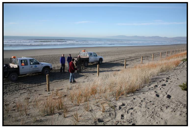
Both spinifex and pingao plants were planted one year earlier and are already forming a small dune.

Various mixtures of pingao and spinifex planted in a 7 m wide zone by Lincoln University students in collaboration with the Christchurch City Council's Coast Care Unit.