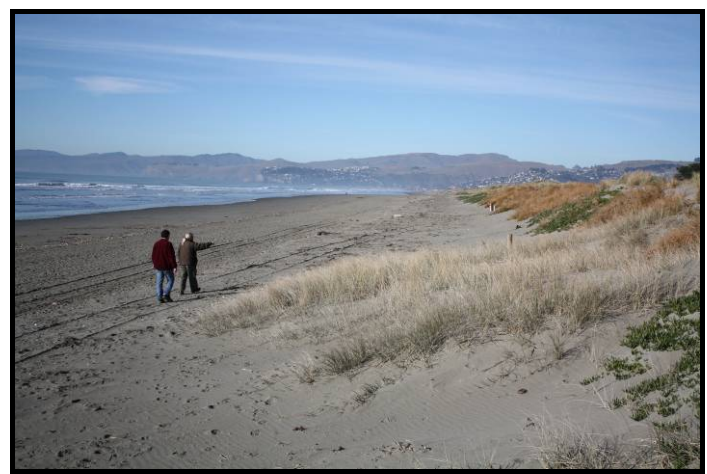
An excellent illustration of the extension seaward of a small planted colony of vigorous spinifex.