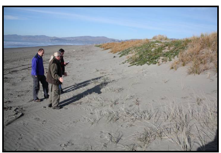
Two rows of well-established spinifex planted one year earlier illustrates that dense planting of many rows may not be required to get a spinifex-dominated sward established along foredunes.