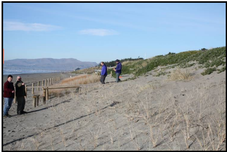
Spinifex seedlings planted one month ago at 40-50 cm plant spacing. Up to 10 rows of spinifex have been planted to form a dense cover along the foredune.