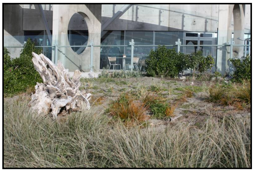
A mixture of pingao, sand spurge and Carex species have been planted landward of the spinifex with a range of indigenous coastal shrubs, particularly taupata further inland.