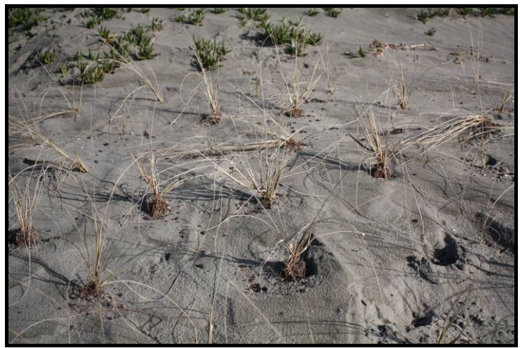
Despite a dense planting pattern and ensuring seedlings were planted into deep pits, a decrease in sand levels within weeks of planting can expose root systems of newly planted sand binders. Planting sites are monitored carefully so that seedlings can be replanted.