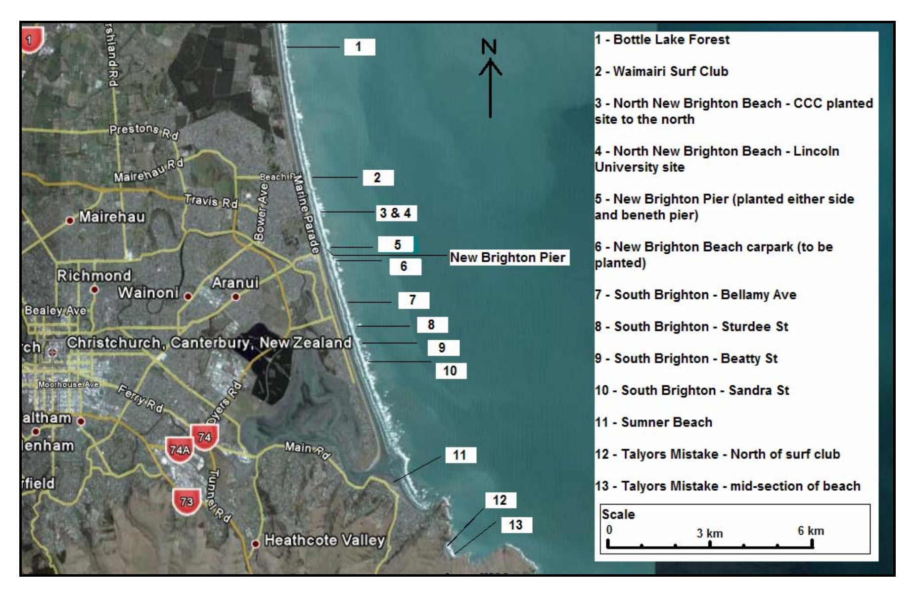
Figure 3: Location of the sites of existing planted spinifex along the Christchuch coast from Bottle Lake Forest in the north to Taylors Mistake in the south.