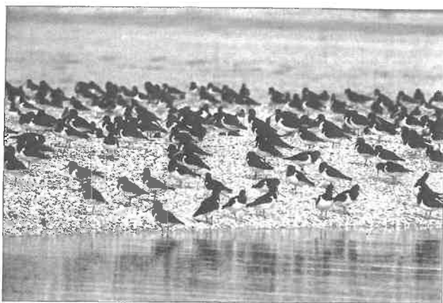
Photo C. Roosting South Island Oystercatchers at Karaka, New Zealand.