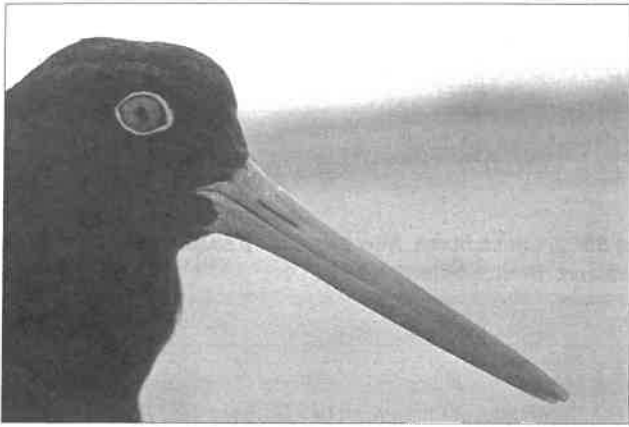
Photo A. Close-up of the head of an adult South Island Oystercatcher.

Breeding used to be confined to gravel riverbeds [Photo B], but since about 1950 it has spread onto arable land and onto high-country tussock grasslands (Baker 1974a). Nests are generally unlined scrapes on a mound or raised area of sand, gravel or soil with good visibility (Sagar et al. 2000). Some pairs breed on coastal beaches where their breeding timetable and habitat overlaps that of Variable Oystercatchers ( H. unicolor ); apparently this has resulted in hybridization at one location (Crocker et al. 2010).