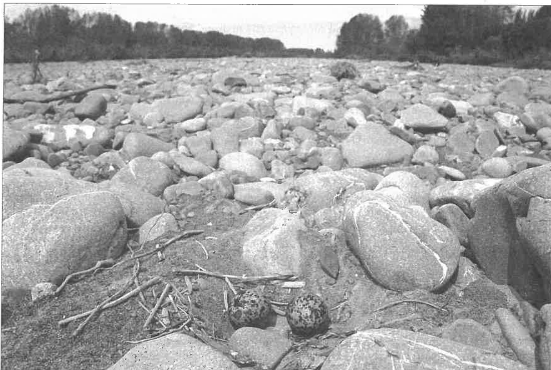
Photo B. Nest of South Island Oystercatcher in the bed of a braided river in New Zealand.

Non-breeding South Island Oystercatchers are spread throughout the coastal regions of New Zealand with two thirds of the population (68%) found in the northern half of the North Island. The Nelson region is also significant as a non-breeding area for about 18% of the population (14,000 birds, Schuckard 2002). The Avon-Heathcote Estuary supports several thousand birds, and Otago Harbour 1,000–2,000; most other estuarine habitats have populations varying from