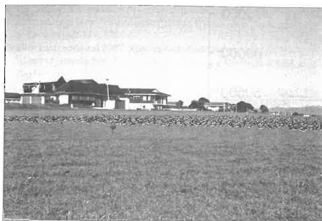
Photo D. Roost of South Island Oystercatchers at Kiwi Esplanade, Manukau Harbour, New Zealand.

hundreds down to occasional winter sightings (Sagar et al. 1999). [Photo C.]