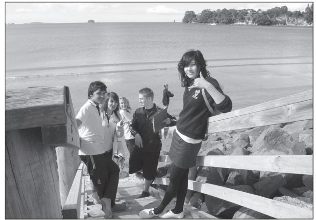
Student scientists ‘getting up close’ with beach features and processes.

At a follow-up joint planning day with CACC team members, the teachers described how they intended to approach the teaching and learning of the unit and what aspects they needed specialist help with. As mentioned earlier, the teachers had opted for a programme of learning where students would work together to produce a solution to a complex, real-world problem: that is, how to mitigate the