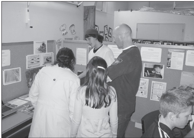
Educating the public about coastal processes at the MBAS Enviro-showcase.

understandings and come to ‘see things in a new light’. Cross-curricular input is essential for this project approach to work – a strategy strongly advocated by the new national curriculum. The real world context of coastal adaptation to change, the opportunity to work with other teachers across the school curriculum, and access to the collective expertise of the CACC team made this collaboration very attractive to the teachers, and so the school and staff accepted the invitation to be involved.