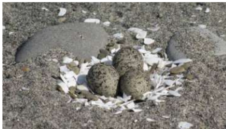
Banded Dotterel nest (Rob Schuckard)