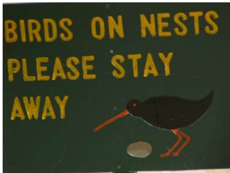
Sign in Abel Tasman National Park ( David Melville).