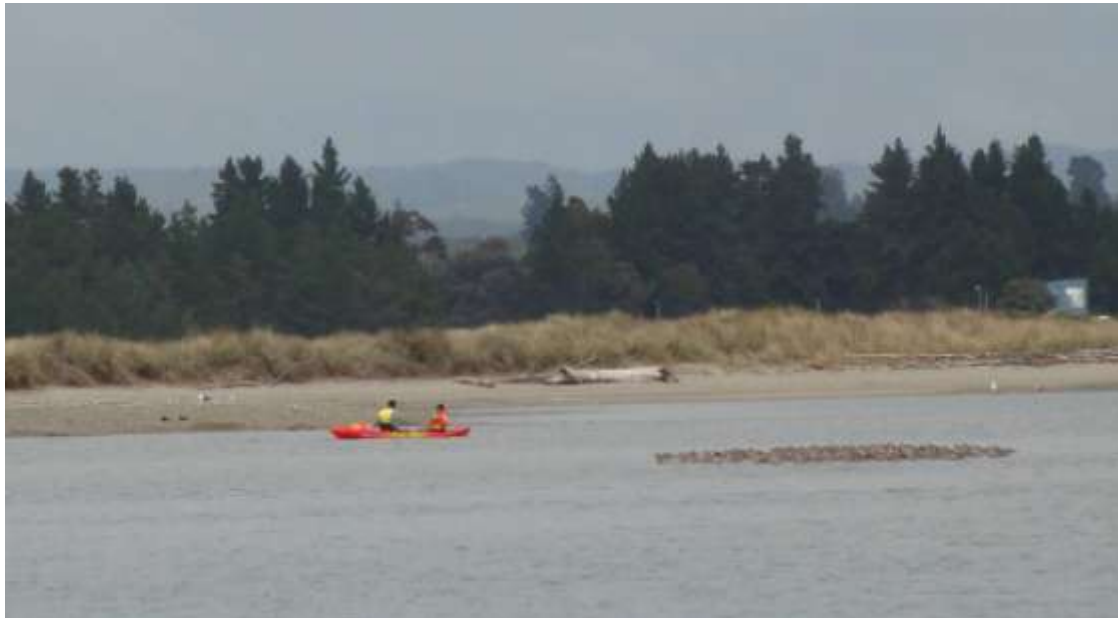
Kayakers approaching roosting Bar-tailed Godwits at Motueka Sandspit

These are relevant to areas under Department of Conservation jurisdiction.