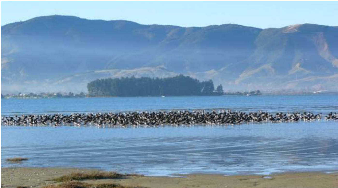
South Island Pied Oystercatchers roosting at Bell Island Shellbank (David Melville)

Future management of sites to ensure that they retain their status of international importance will require management of threats, both directly at individual sites and in the wider environment. In particular it must be recognised that all of the currently identified 'sites' of international importance (as referred to in Melville & Schuckard, 2013) relate to roost sites – and do not take into account foraging areas used by waders from the various roosts nor incorporate the importance of a site as a breeding habitat (Table 6). Furthermore a precautionary approach for other areas of lower than international importance is required. An update of breeding shorebirds and other coastal species including 'threatened' and 'at risk' Black-billed and Red-billed Gulls, Caspian Tern, White-fronted Tern and Banded Rail is of utmost urgency. OSNZ could potentially play an important role for this breeding habitat survey.