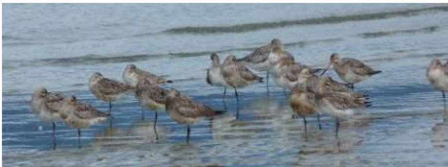
Bar-tailed Godwits roosting at Bell Island Shellbank (David Melville)

It is recommended that the Tasman Resource Management Plan (TRMP) be reviewed to expand the rules regarding the effects of vehicles and craft (including hovercraft) to include disturbance that is likely to displace shorebirds from an area temporarily or long term. Schedule 25D of the Plan also needs revising to include the seven additional internationally-significant sites: Westhaven Inlet, Pakawau, Totara Avenue/Collingwood, Rototai, Motueka Sandspit, West Waimea Inlet and East Waimea Inlet. Management actions are recommended specifically for each of the internationally-important shorebird areas in Tasman.