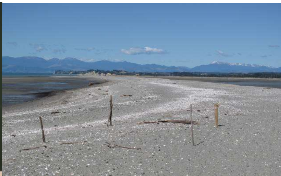
Banded Dotterel nest with protective fencing, Motueka Sandspit - fencing of individual nest attracts public attention – generally it is better to fence off nesting areas rather than individual nests (David Melville)