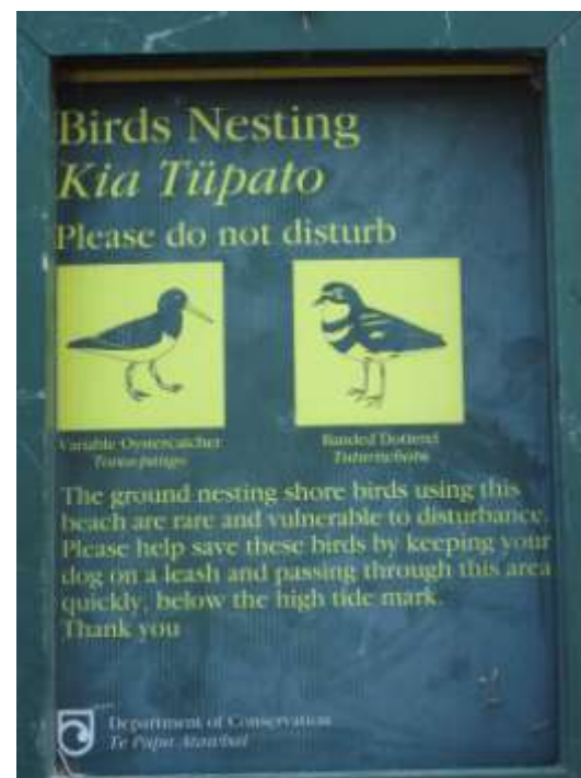
Signs at Motueka Sandspit