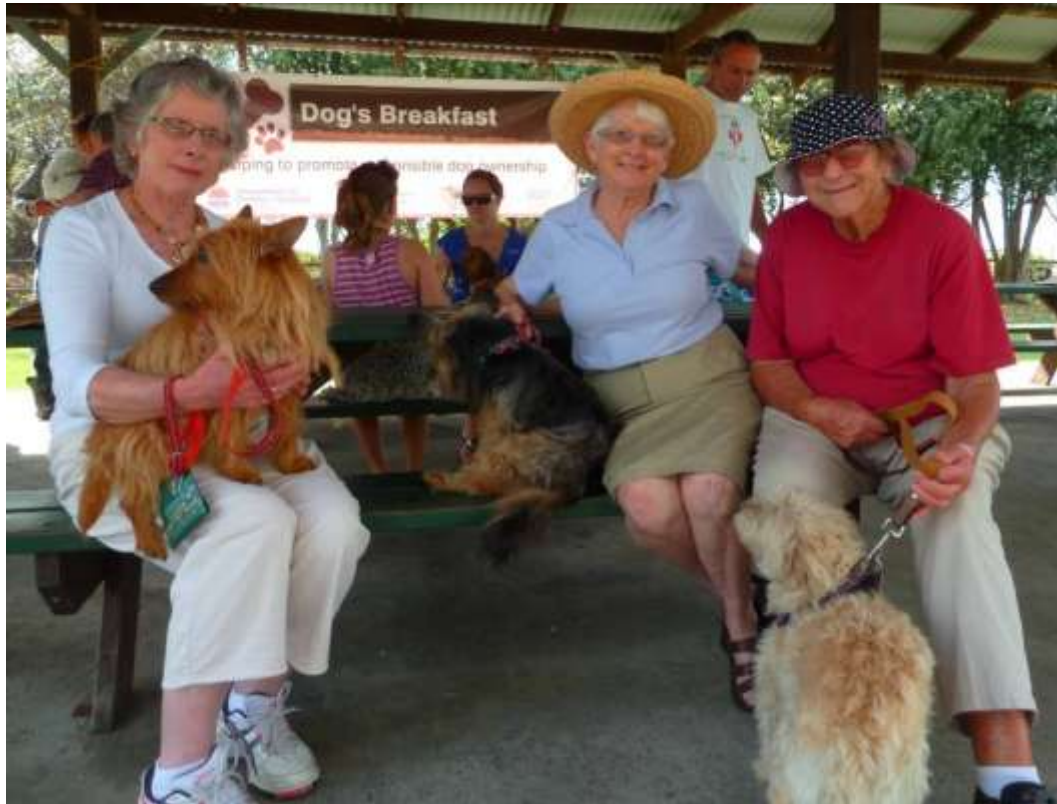
Dog's Breakfast event, Australia (New South Wales Department of Environment and Heritage)