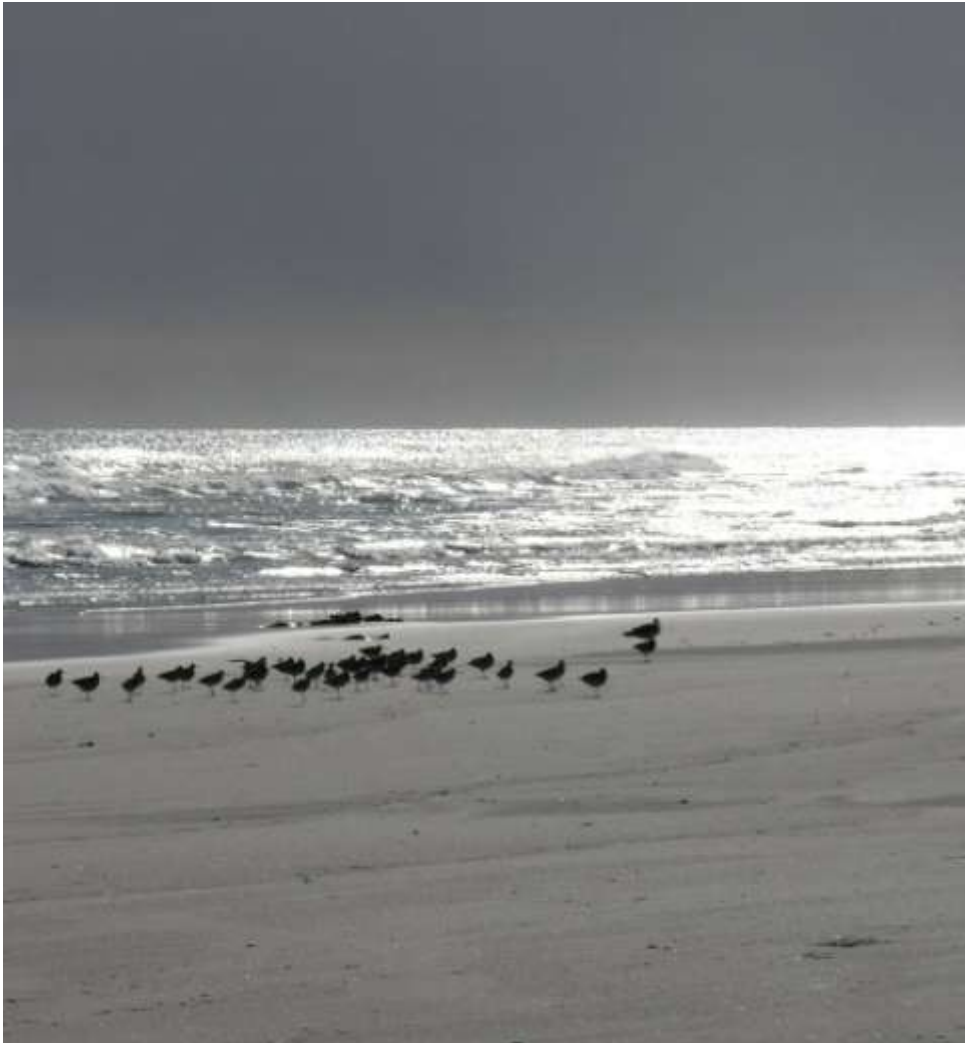
Bar-tailed Godwits roosting at Farewell Spit (David Melville)

Continued monitoring of populations and site conditions (roosting, nesting, feeding) is considered necessary as part of State of the Environment monitoring to determine the effectiveness of coastal management actions and RMA compliance. Specific monitoring recommendations are listed in Schuckard & Melville (August 2013).