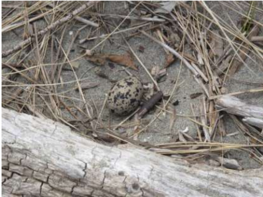
Variable Oystercatcher nest, Motueka Sandspit (David Melville)