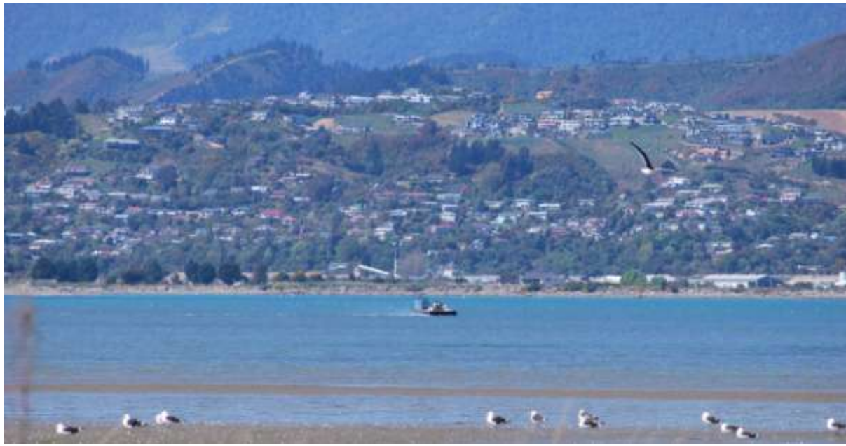
Hovercraft in Waimea Inlet