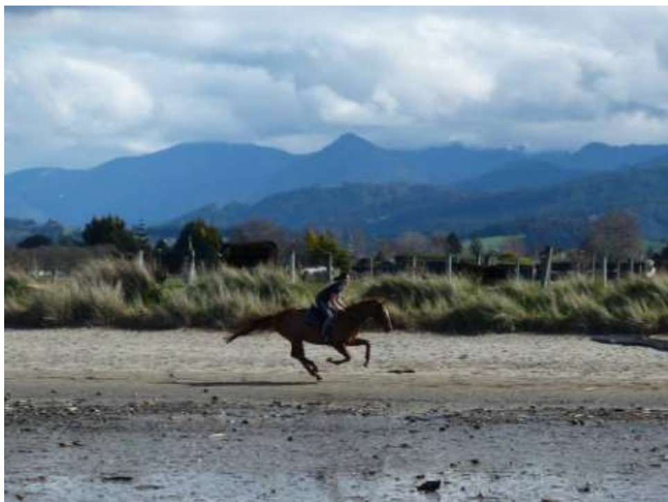
Horse riding on the beach Raumanuka Scenic Reserve, Motueka (Julia Melville)