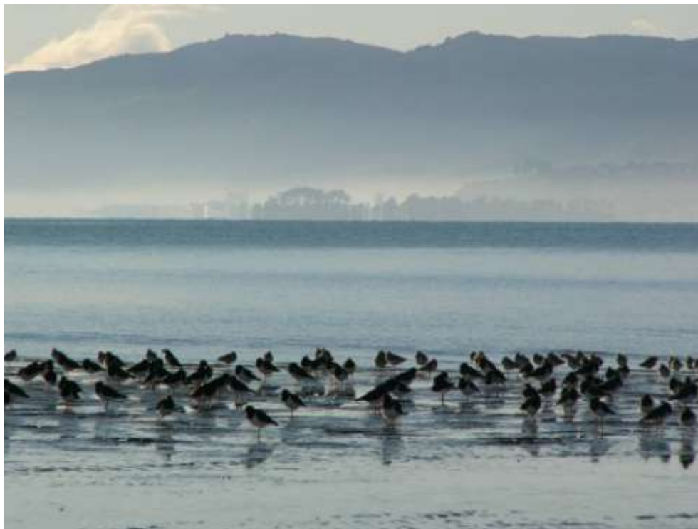
South Island Pied Oystercatchers roosting at Bell Island Shellbank (David Melville)