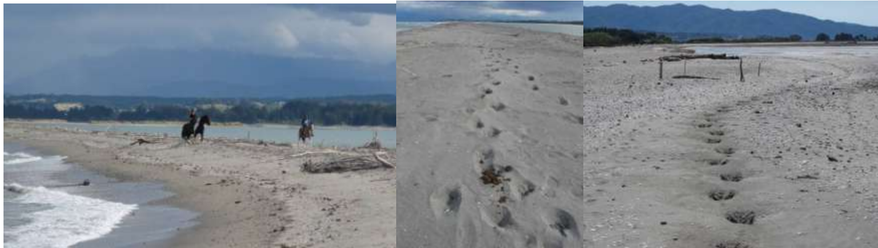
Horse riding above the tideline, Motueka Sandspit Scenic Reserve