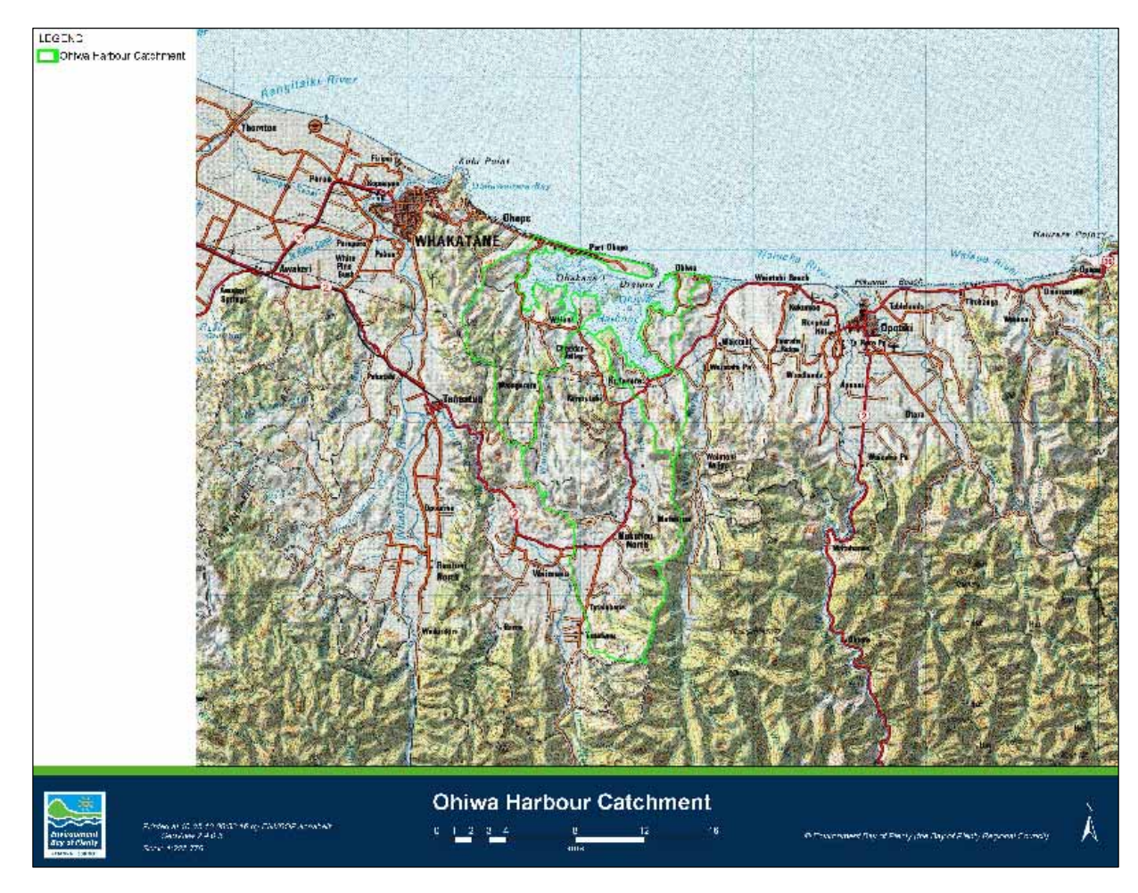
Figure 1 Map of Ohiwa Harbour Catchment location.

The information in the reports summarised in this document needs to be collated if an overall document of the status of the ecology of Ohiwa Harbour and its catchment is to be produced. This would allow an improved understanding of the state of the ecology of the catchment and any significant issues it faces. A brief discussion of what would be involved in the collation of such a document concludes this report.