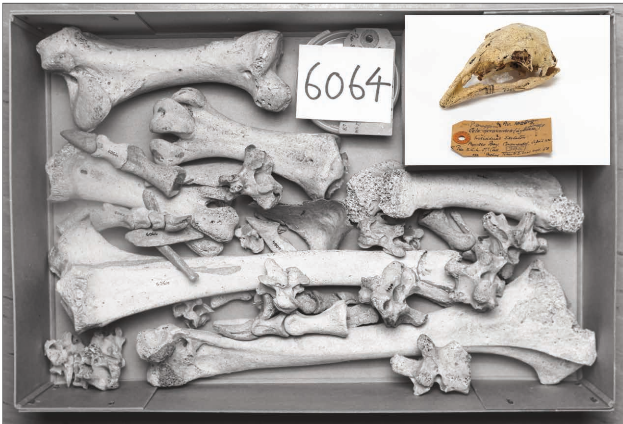
Figure 3. Bones from a skeleton of Pachyornis geranoides collected from sand-dunes at Papa Aroha, Coromandel Peninsula, by S.C.L. McCall in 1926. The L femur at top left is 193 mm long. Auckland War Memorial Museum, LB6064.