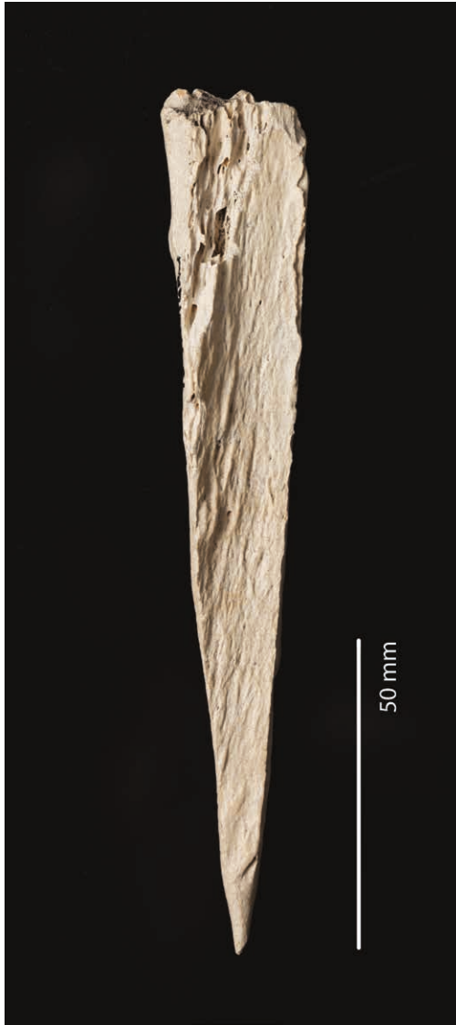
Figure 7. Awl fashioned from a thick bone fragment assumed to be from Dinornis novaezealandiae ; Te Matakau archaeological site, Ahuahu Great Mercury Island. Auckland War Memorial Museum, 48928.