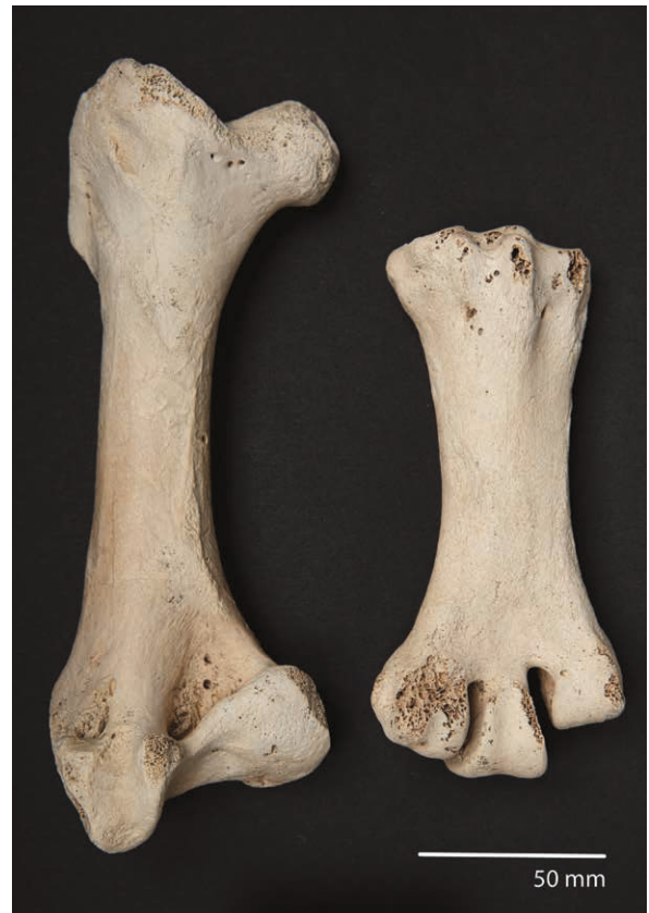
Figure 5. Near-intact Euryapteryx curtus L femur (left of picture), and R tarsometatarsus of small moa (Emeidae), from Port Jackson archaeological site. Auckland War Memorial Museum, 1995.47.6.

In the Auckland region only four of the seven archaeological sites with moa have been excavated, and there is an expectation that a larger sample of bones would be recovered from these sites compared to surface finds. A. didiformis and E. curtus are not represented from the archaeological excavations as identifiable elements, but may be present in the undiagnostic fragments. However, with similar results to the distribution on