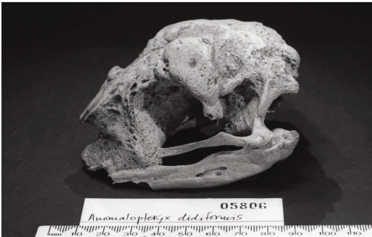
Figure 4. Skull of Anomalopteryx didiformis collected at Eastern Beach, Bucklands Beach, Auckland, by E. Pegler in 1954. The bone is partly obscured by concretionary matrix. Smallest divisions on scale are 1 mm. Auckland War Memorial Museum, LB5806.