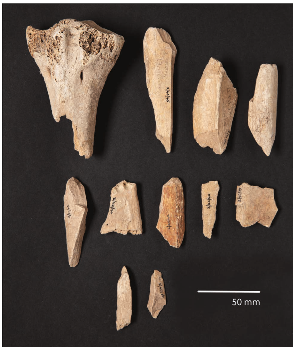
Figure 6. Proximal end of Dinornis novaezealandiae L tarsometatarsus (top left) and moa bone fragments typical of archaeological sites, Opito Beach Midden. Auckland War Memorial Museum, 2014.80.783.